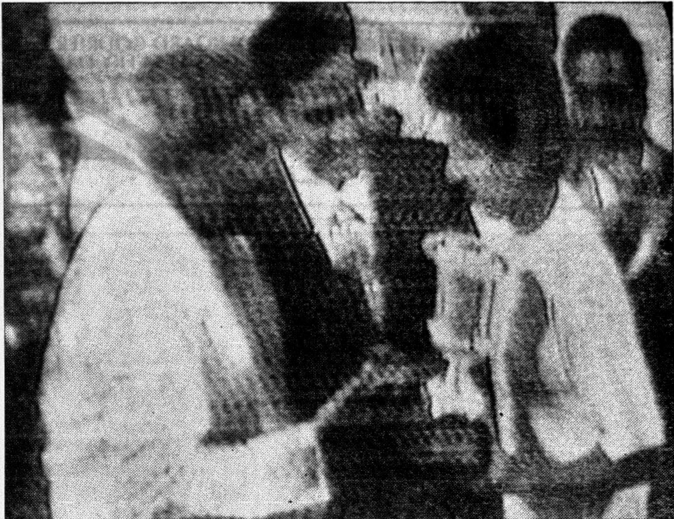
Pakistan captain Rameez Raja (2nd from right) receiving the trophy after the final of the three-nation Siyaram Cup tournament in Hyderabad yesterday. Pakistan defeated India by five wickets.