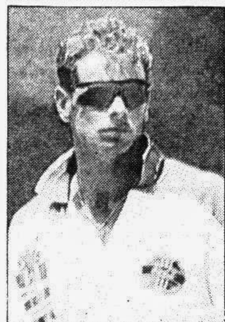
REIFFEL... 3 for 12

Scoreboard on the second day of the three-day match between Leicestershire and Aus-