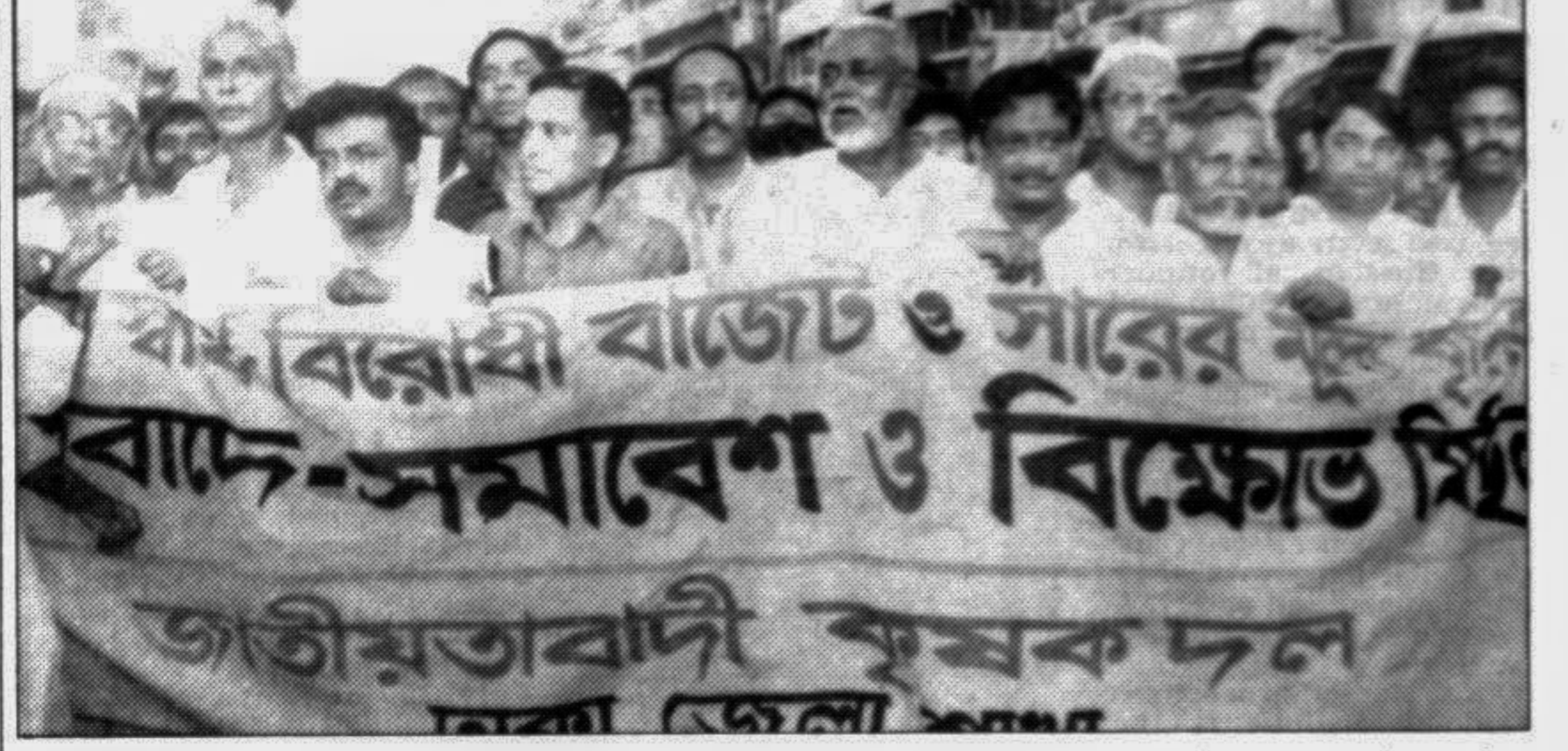
Jatiyatabadi Krishak Dal brought out a procession in the city yesterday protesting price hike of fertiliser and other agri-inputs.