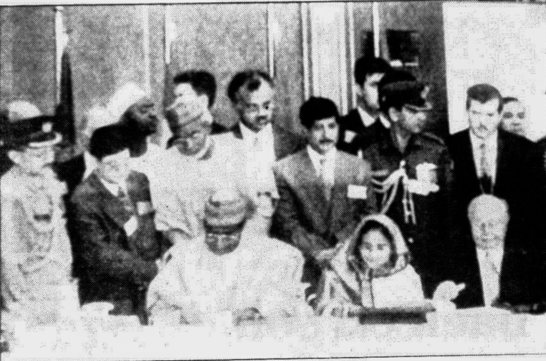
Prime Minister Sheikh Hasina signing the Istanbul Declaration launching the D-8 yesterday.