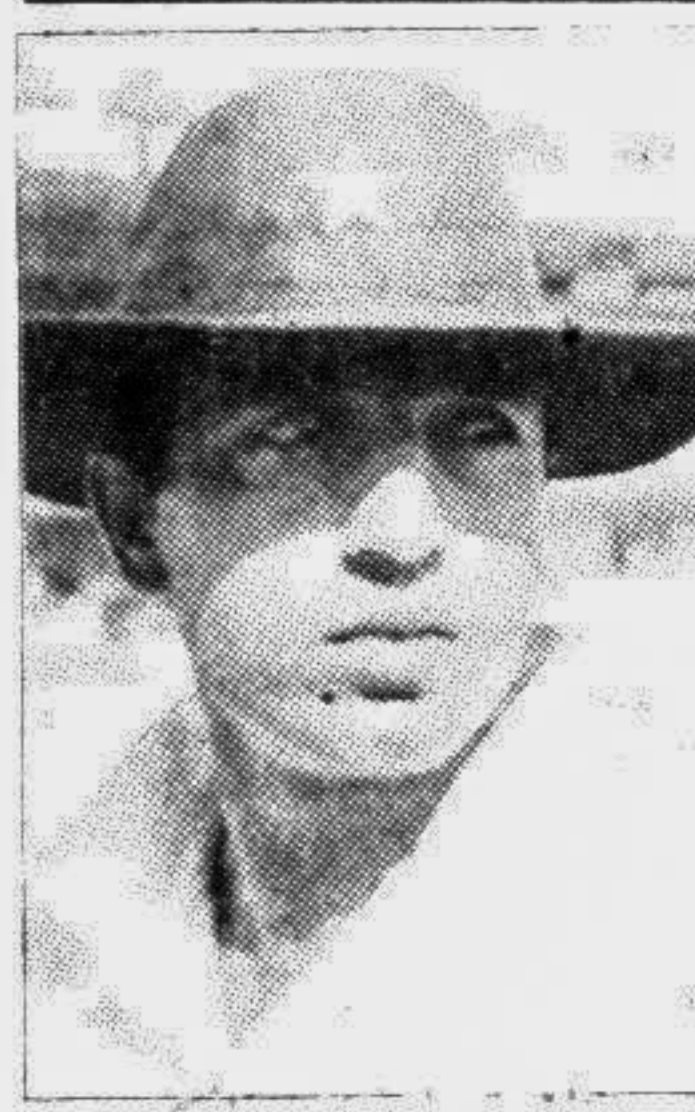
Saeed Anwar (Pakistan's dashing opening batsman)

The elegance of Mark Waugh. The ease with which he plays. That is something which I envy. (On his feelings about contemporary star performers).