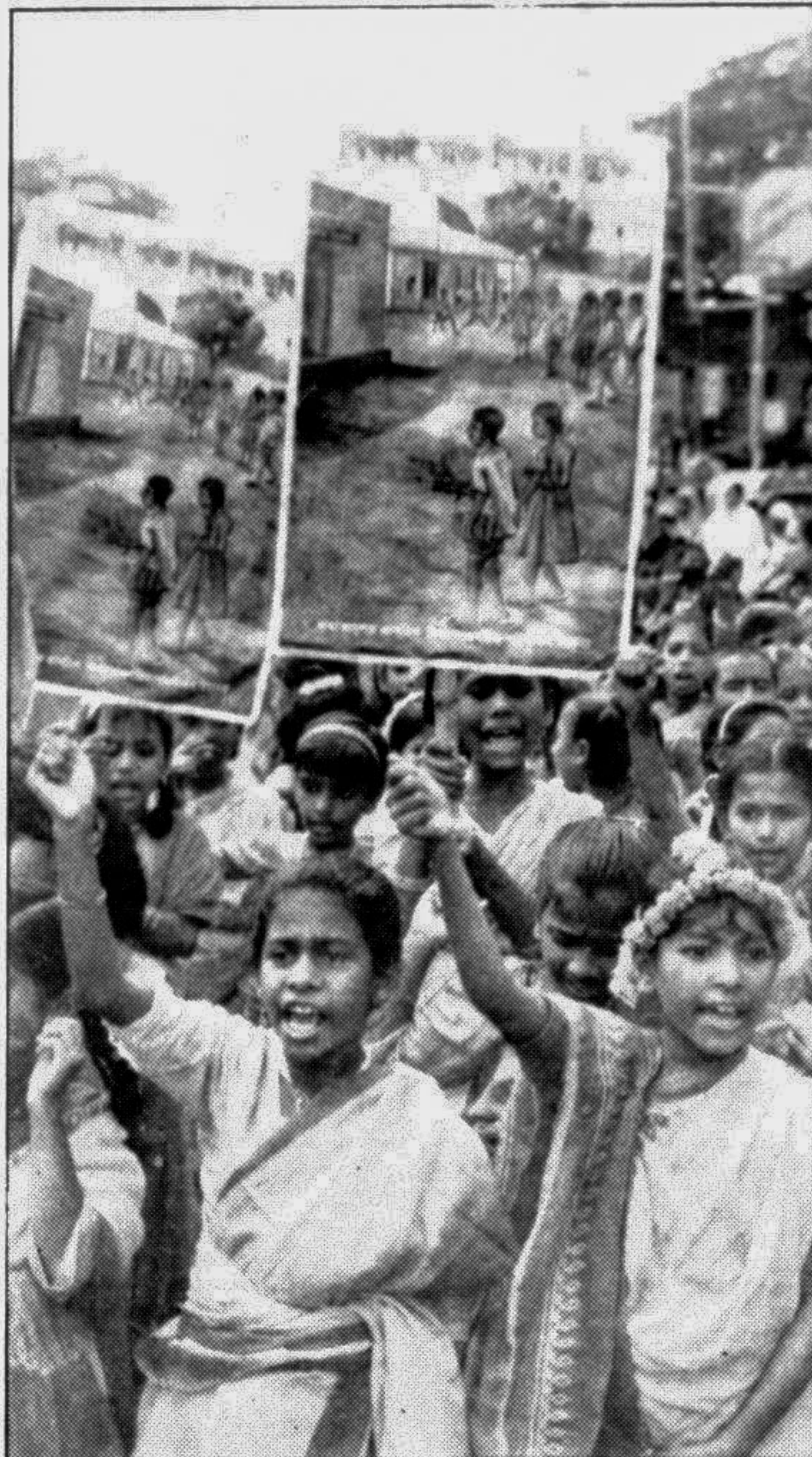
A children's procession in observance of the National Primary Education Week '97 was brought out in the city yesterday by the Monitoring Unit for Implementation of Compulsory Primary Education.

domestic production in this sector. Urging people specially the business community to extend all out cooperation to the government for creating favourable measures for development, he hailed the proposals for setting up a housing fund in the social sector, old age pension and setting up of an employment bank. He also welcomed major reform proposals on direct tax. He mentioned that by expanding the tax base a large number of people will be brought under the tax network which will have positive effect in revenue earning. But the success of these proposals will largely depend on the sincerity and efficiency of tax officials engaged at field level, he pointed out. High priority given in allocating funds for education, human resource development and poverty alleviation deserves appreciation. Adequate physical infrastructure is a pre-condition for industrialisation and allocation of Tk 7,327 for development of this sector is praise-worthy, the FBCCI president observed. He further said it was expected that there will be minimum difference of 10 per cent corporate tax in case of listed companies to rejuvenate the capital market. Reduction of corporate tax will certainly help industrialisation. The proposal for privatisation of 65 state-owned enterprises in the next fiscal year is a step in the right direction. This will ensure savings of a large sum of money for the government as subsidy to these public sector enterprises, the FBCCI president noted.