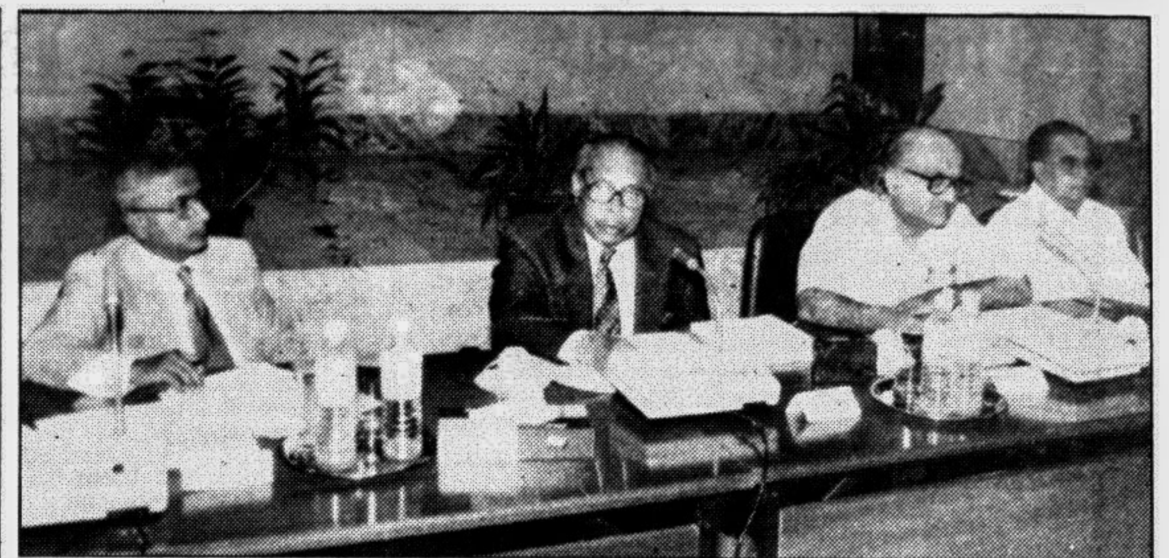
Finance Minister SAMS Kibria addressing a dialogue on 'the state of the Bangladesh economy and the role of the budget in stimulating economic activity', organised by the Centre for Policy Dialogue at the CIRDAP auditorium in the city yesterday.