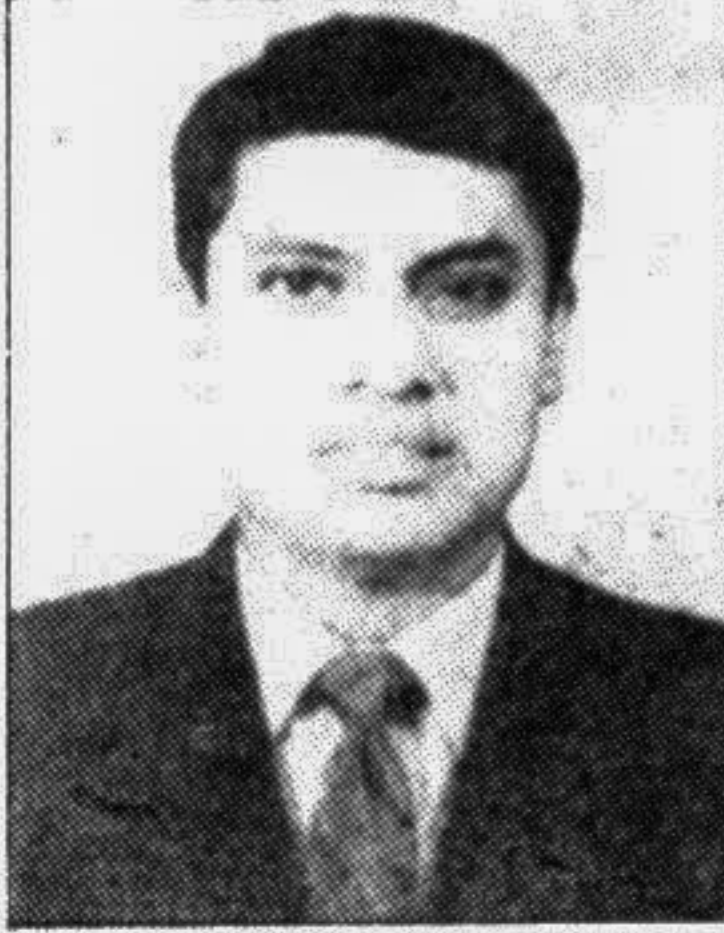
ASHRAFUL HAQUE Bangladesh's bid, however, got a big boost when Bangladesh Cricket Board (BCB) president Saber Hossain Chowdhury, MP,

Improvement, recently, was quite eager to give a promotion to the elite echelon with the senior status.