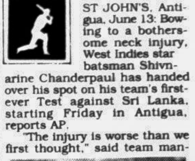
A RANATUNGA ager Clive Lloyd on the eve of the match Thursday. "Shiv will not be able to make it at this stage."

ST JOHN'S, Antigua, June 13: Bowing to a bothersome neck injury, West Indies star batsman Shiv-