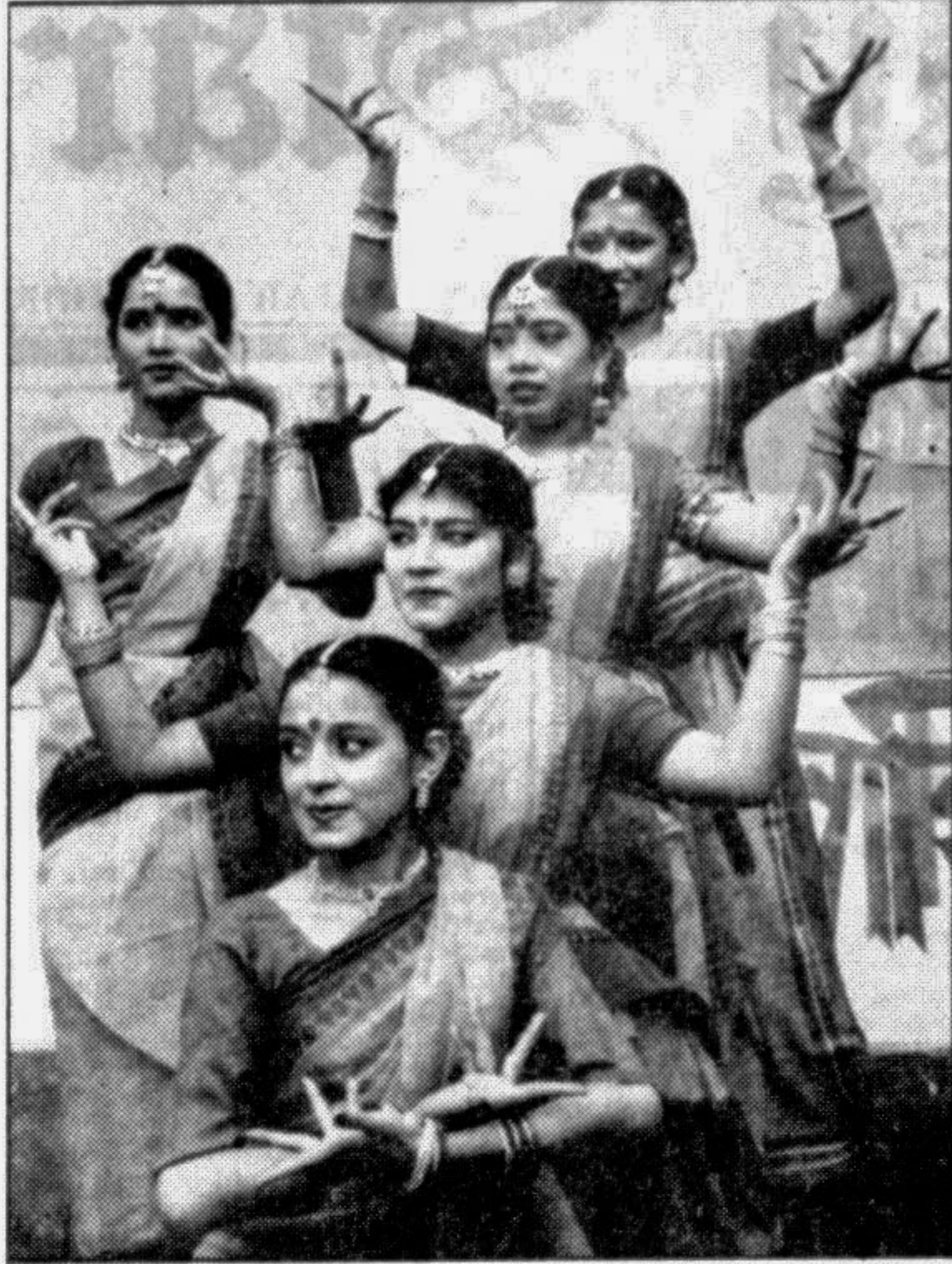
Kendriyo Kachi Kanchar Mela celebrated its 40th anniversary with a cultural function in the city yesterday.

No: COS/CLEARANCE/97-TEND Dated: 10.06.1997 Sealed tenders are invited from eligible clearing and forwarding agents as indicated below for clearance of 30,000 nos Broad Gauge Wooden Sleepers from Mongla Port including loading and carriage up to Nowapara Railway Depot and unloading and stacking. 2. Only those firms which are approved as C&F agent of Khulna Custom Authority and have valid licence from Mongla Port Authority and have the past experience of clearing and transportation of bulk and heavy materials from Mongla Port to Khulna area, are eligible to participate in this tender. 3. Tender document can be purchased during office hours on all working days with effect from 17.06.1997 to 23.07.1997 from the office of the Controller of Stores/Project, Bangladesh Railway, Central Railway Building, Chittagong as well as from the office of the Executive Engineer/Project, Bangladesh Railway, Kamalapur, Dhaka on cash payment of non-refundable sum of Tk 750.00 (Taka seven hundred fifty) only. 4. The tender document must reach the office of the Controller of Stores/Project, Bangladesh Railway Central Railway Building, Chittagong or be dropped in the tender box placed in his office chamber at Central Railway Building, Chittagong by 11.00 hrs on 24.07.1997 which will be opened at the same place and on the same date at 11.30 hrs. 5. Tenders will not be received after the specified date and time. M Abdullah Controller of Stores/Project Bangladesh Railway Chittagong D-720