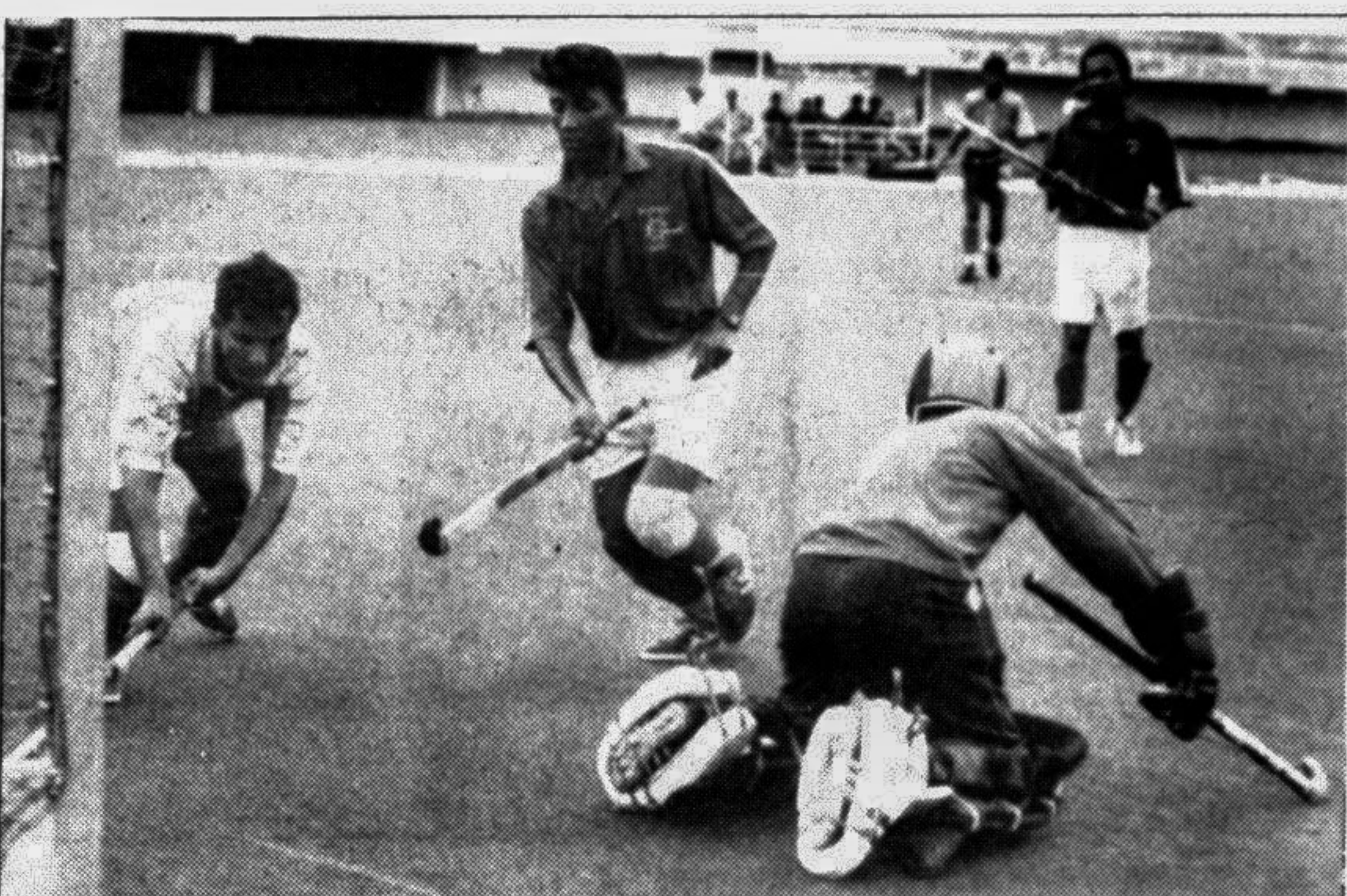
Action from yesterday's Green Delta First Division league match between Mariner Young's Club and Sonali Bank at the Hockey Stadium.