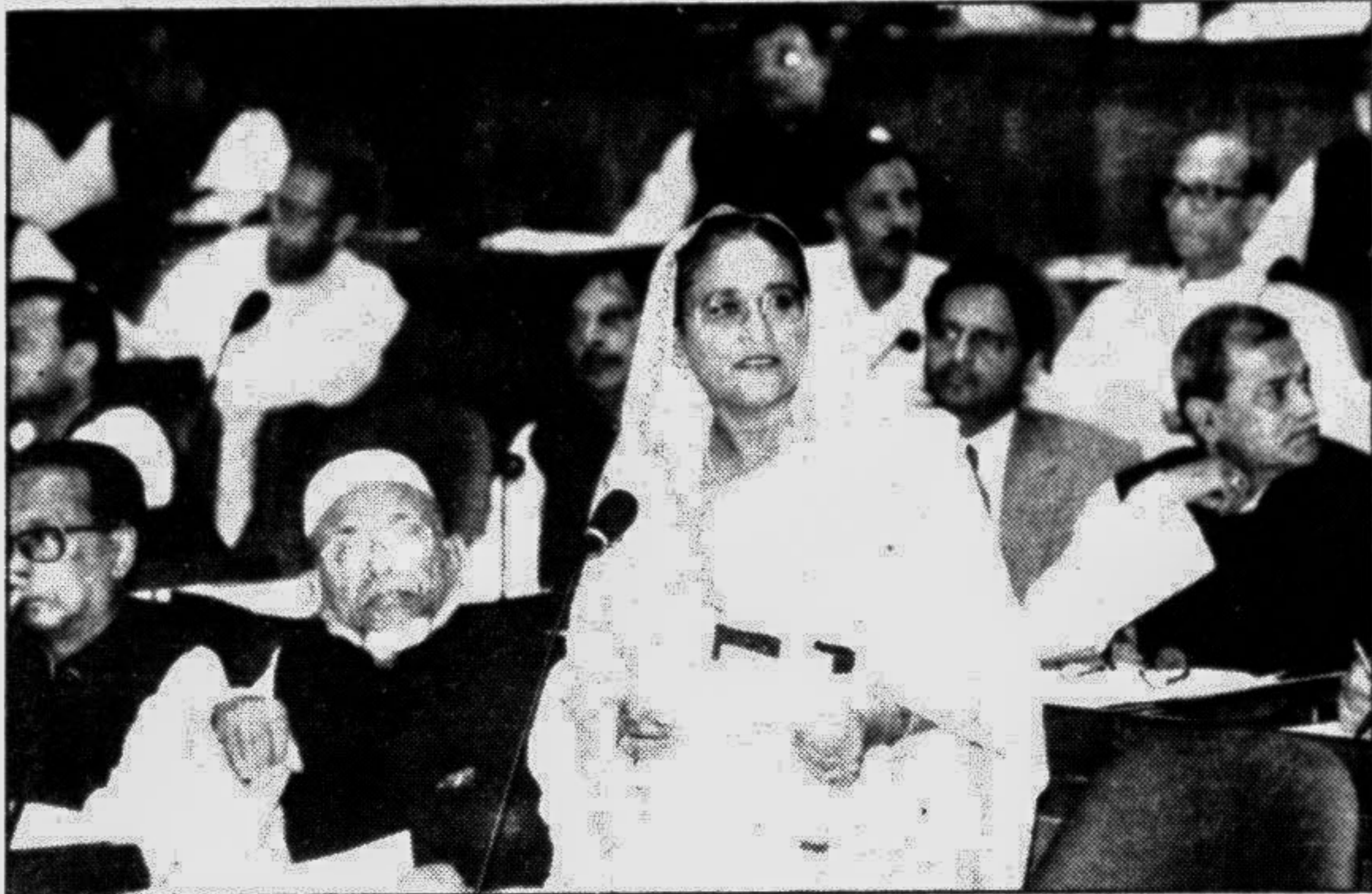
Prime Minister Sheikh Hasina replying to questions in the Jatiya Sangsad yesterday.