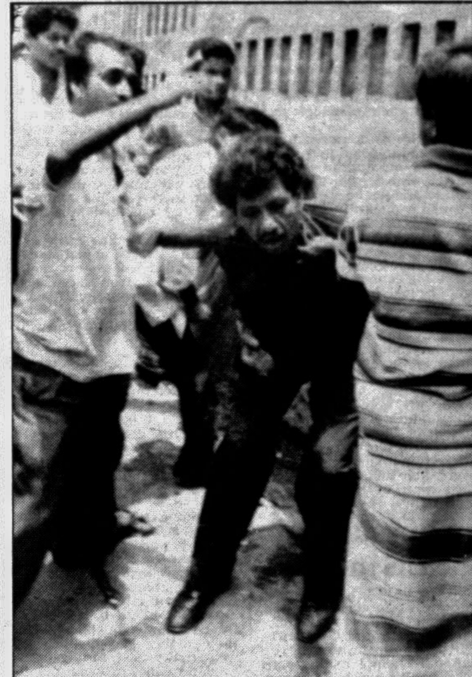
People beating an alleged snatcher in Purana Paltan area in the city yesterday.

The foreign oil companies are: Cairn (UK), Occidental (US), UMC and Rexwood-Okland. Cairn discovered Sangu-1 gas well in the Bay of Bengal and is now working in Chittagong and the Chittagong Hill Tracts. Occidental has begun drilling a well in Jalalabad, Sylhet. UMC signed a PSC for exploration deeper in the hill tracts and Rexwood-Okland is to explore the Bay of Bengal near Teknaf and St Martin's Island.