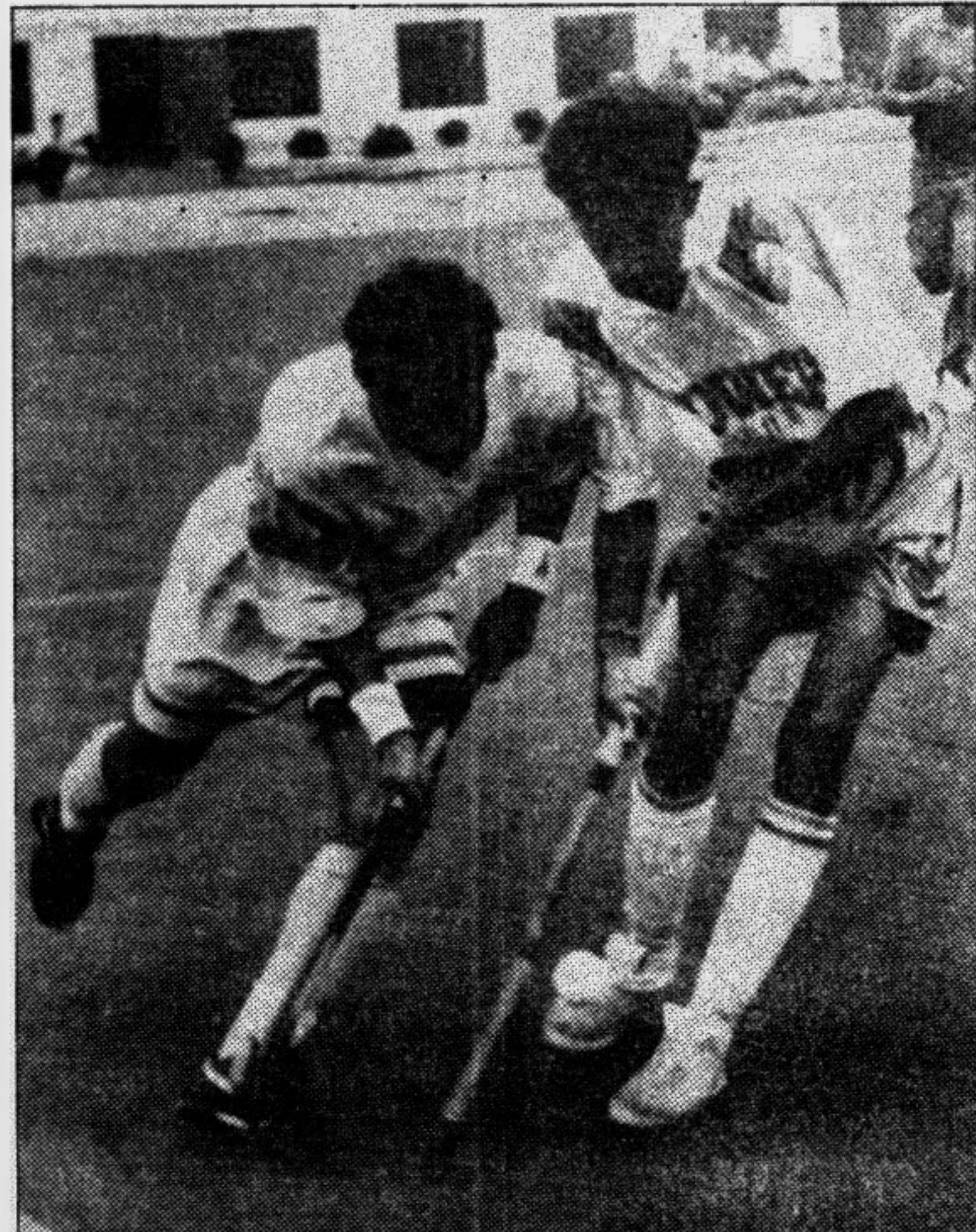
Action from yesterday's Green Delta First Division league encounter between Abahani Krira Chakra and Sadharan Bima Krira Sangstha at the National Hockey Stadium. Abahani lost 2-3.

The win raised Azad's tally to 10 points from as many matches. On the other hand, Ansars suffered their tenth successive defeat.