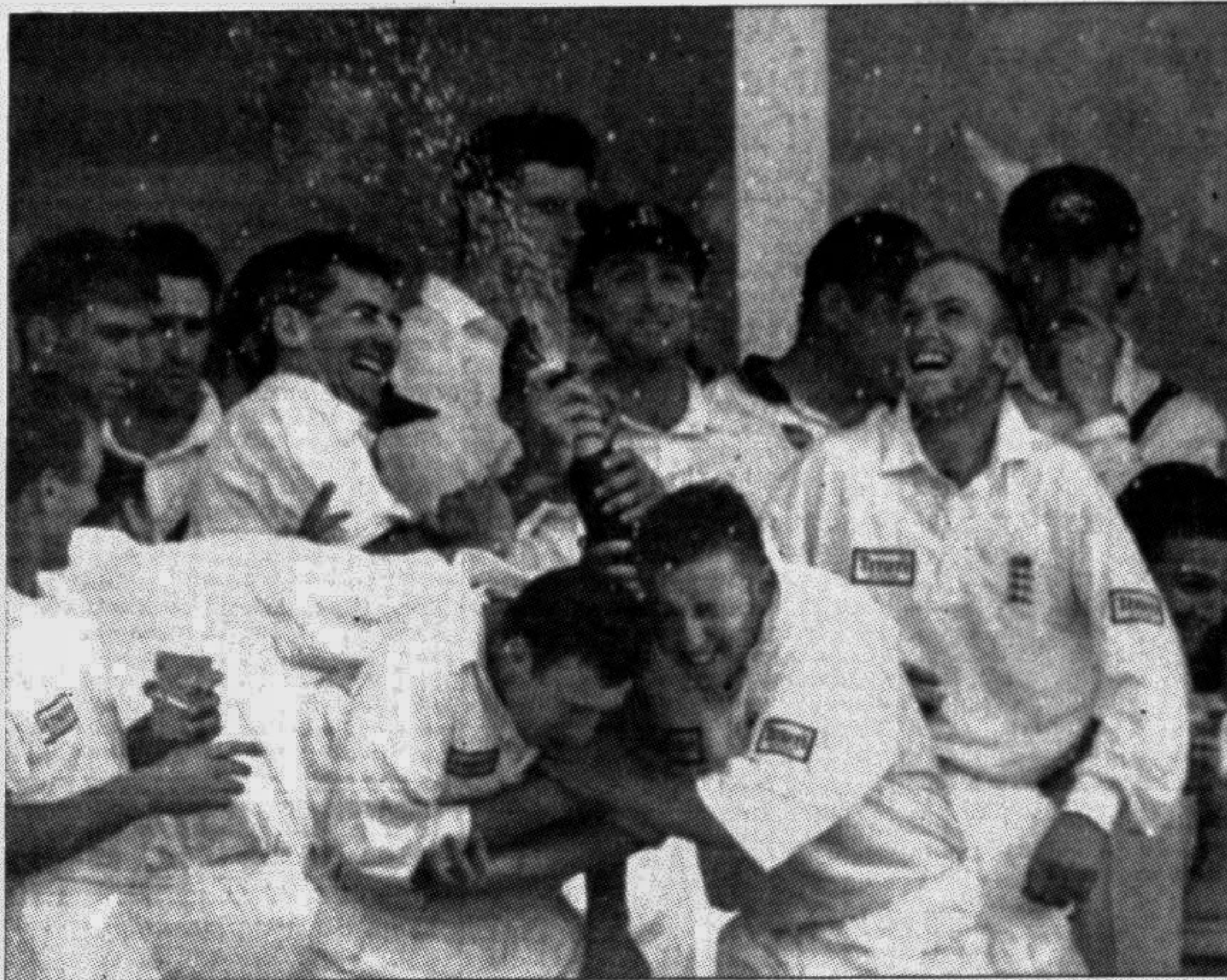
IT'S PARTY TIME: England skipper Mike Atherton (C) and his delirious mates celebrating a rare Test victory against Australia on Sunday. England won the first of the six-Test Ashes series by nine wicket at Edgbaston.

Swiss planners have increased to 160 million Swiss francs (114 million dollars) the amount that would be spent on sites for the games. That is an increase from the 75 million francs (54 million dollars) offered in the bidding for 2002.