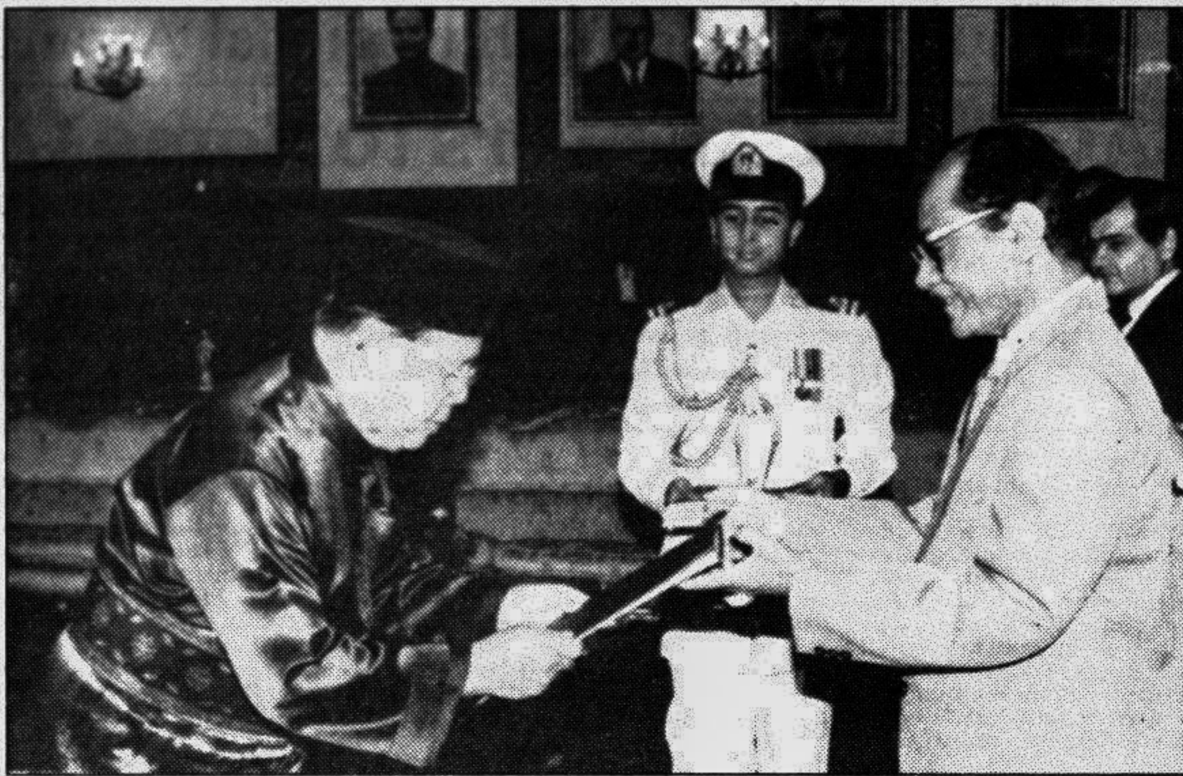
Newly appointed High Commissioner of Brunei-Darussalam presenting his credentials to President Justice Shahabuddin Ahmed at Bangabhaban yesterday.