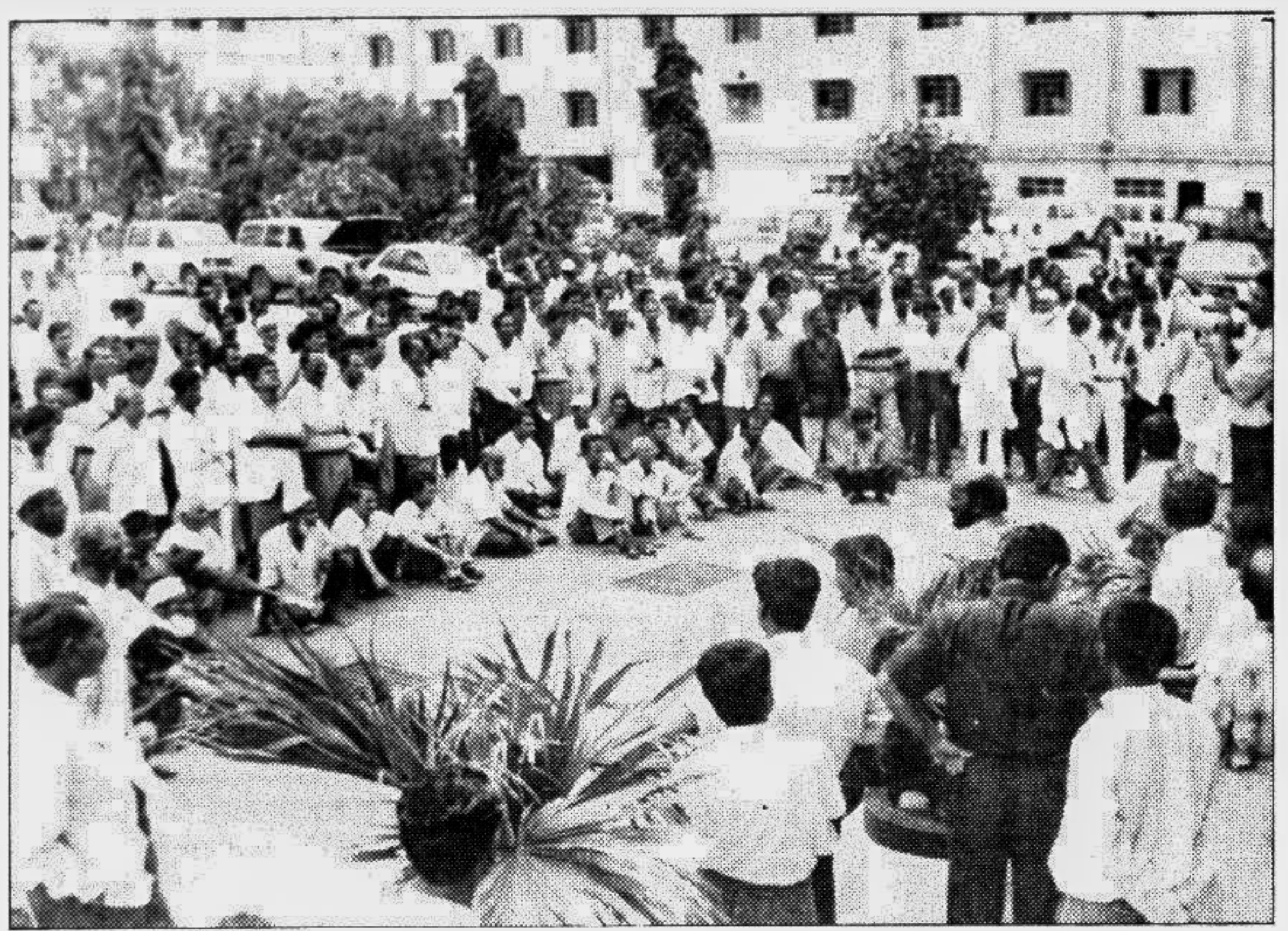
A section of Secretariat employees held a rally in the Secretariat yesterday.

From Our Correspondent RANGPUR, June 8: Indian authorities, aided by the BSF, have resumed construction of a road along the zero point of the border at Patgram thana, ignoring protest by the BDR, sources in the BDR said today. Indian roads and highways officials had earlier started construction of a road along the border pillar Nos. 806 and 807 but stopped it following protest by the BDR. But they resumed the construction work on Friday under the cover of the BSF. More than one hundred people including roads and highways officials are engaged in the work, BDR sources said. The BDR has lodged a written protest with the BSF to stop construction of the road along the zero point of the border, but the work is going on, the sources said. See Page 12 Col 2