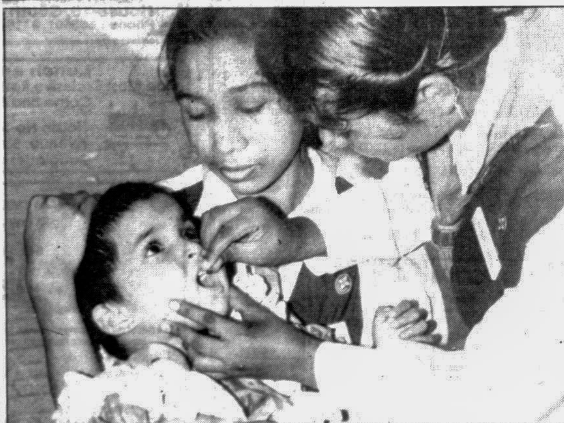
Members of the Girl Guide administering Vitamin-A capsules to children at the Guide House at Shantinagar in the city yesterday, the first day of the Vitamin-A Week.