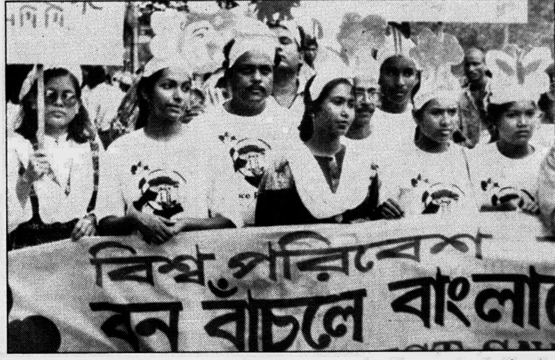
The Nature Conservation Committee brought out a colourful procession in the city yesterday on the occasion of the World Environment Day.

The programmes on the day include, hoisting of national and party flags at Bangabandhu Bhaban and all offices of the party at 6 am, placing of wreath by Prime Minister and AL chief Sheikh Hasina at the portrait of the Father of the Nation Bangabandhu Sheikh Mujibur Rahman at Bangabandhu Bhaban at 7 am, and workers rally at Tejgaon at 3:30 pm.