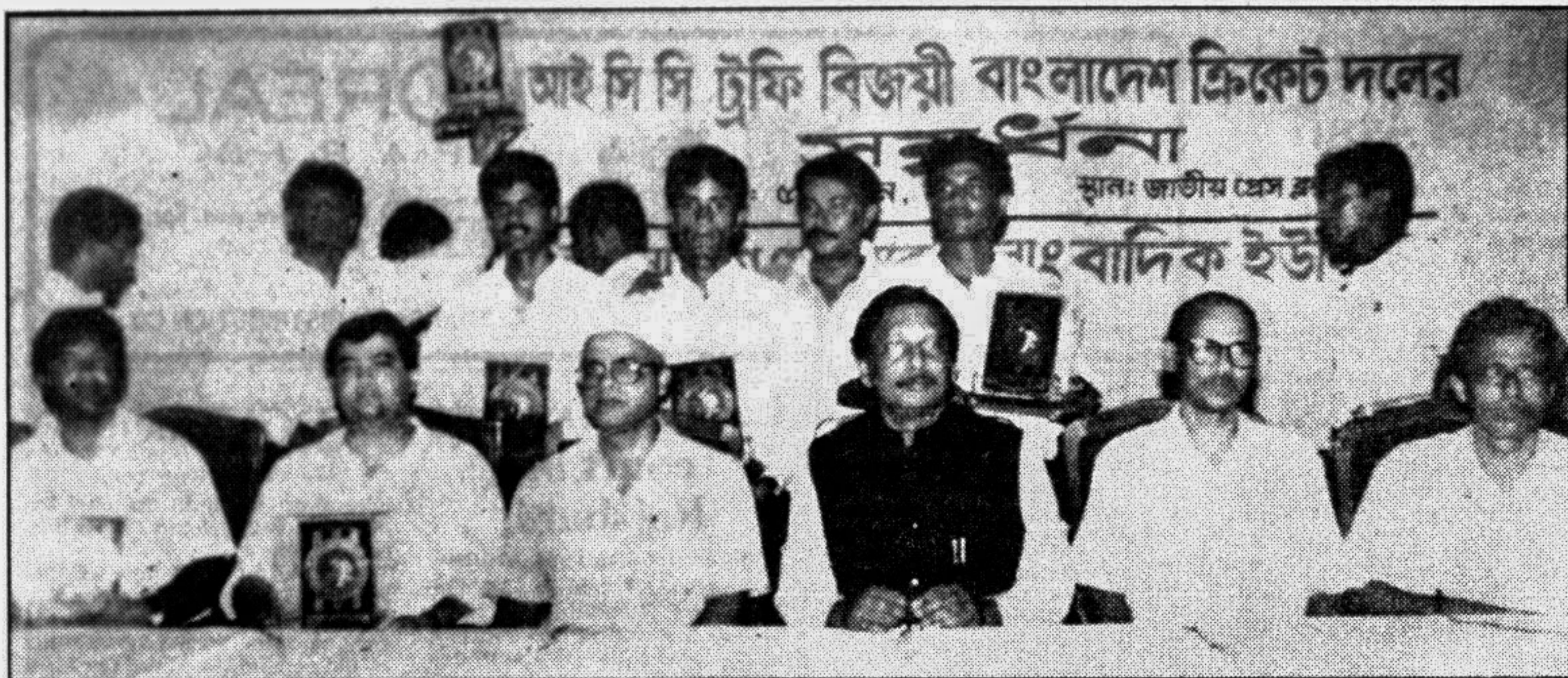
Members of the Bangladesh cricket team pose with the guests during a reception accorded by the Bangladesh Federal Union of Journalists at the Jatiya Press Club yesterday.