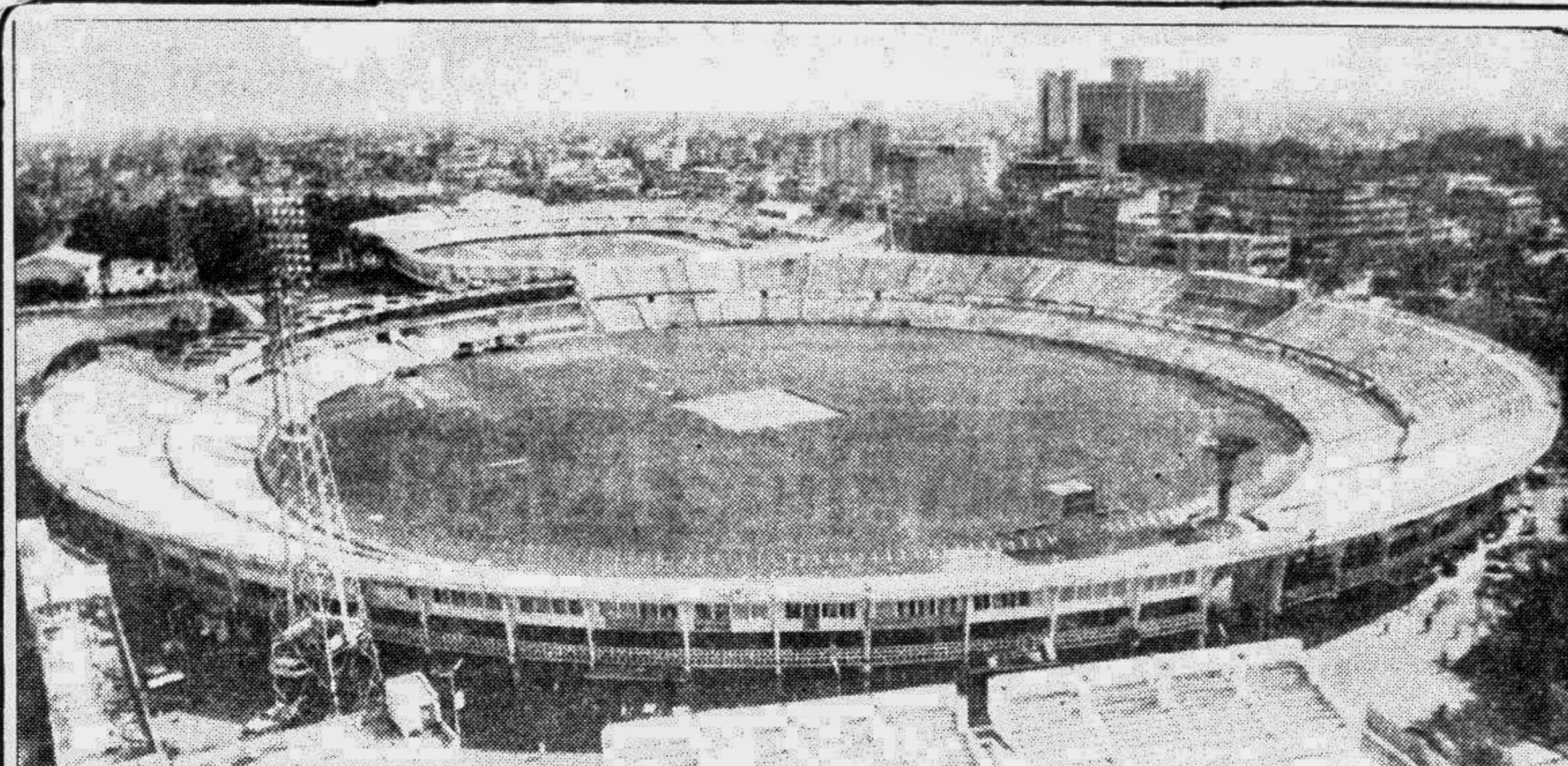
THE SILENT SPECTATOR: An exquisite bird's eye view of the Dhaka Stadium which bears witness to the decades-old clammy tug-of-war between the football and cricket federations. It reveals a square scar at its heart now. The pitch of the historic venue has been torn down recently to install sporting wicket.

YORKTOWN HEIGHTS, New York, June 4: Israel's Trade Minister Natan Sharansky, a Russian decent chess fanatic who mastered the game while imprisoned in the Soviet Union, lost an exhibition match Monday against Deep Blue Jr, the light version of the IBM computer that defeated chess champion Garry Kasparov, reports AP. Sharansky, whose tour of the United States ended Monday, visited IBM's TJ Watson Research Center in New York to discuss emerging information technology issues, preview future trends. He also played chess. Chess is the 49-year-old mathematician's beloved hobby. He often talks in interviews about how he played the game in his head during months of isolation in Soviet prison. Convicted of spying for the United States, Sharansky spent nearly a decade in custody before being freed in 1986. Sharansky defeated Kasparov in an exhibition chess game in Jerusalem last year. Sharansky had requested the opportunity to play against the computer, which is capable of calculating up to 20 million moves per second. The Deep Blue version that defeated Kasparov can process 200 million a second. In addition to its chess-playing ability, Sharansky said he also was impressed with the supercomputer's other applications. He said that although Kasparov's defeat in May was crushing, it was helping to bring about "absolutely revolutionary" technology.