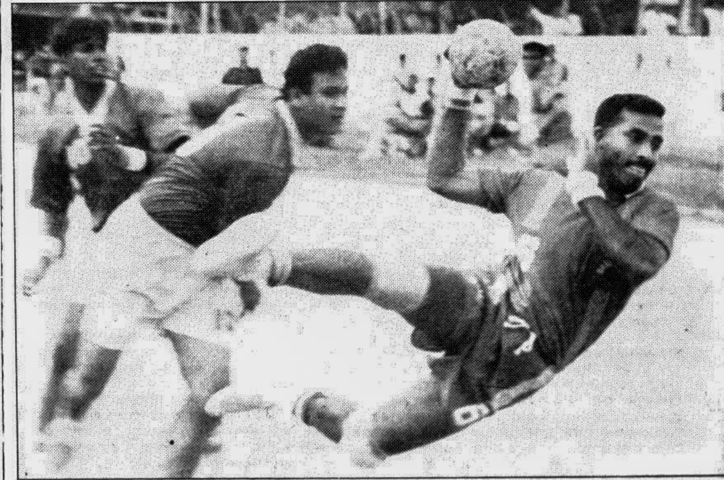
Action from yesterday's Cute Premier league encounter between Bangladesh Rifles and Police at the handball court near to Dhaka Stadium. Riflemen won 37-20.