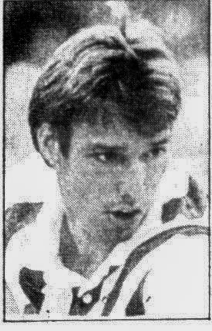
Michael Stich (German tennis player) "I don't consider him (Becker) an idol. I respect Becker very much as a tennis player." (Said of his illustrious compatriot and rival)