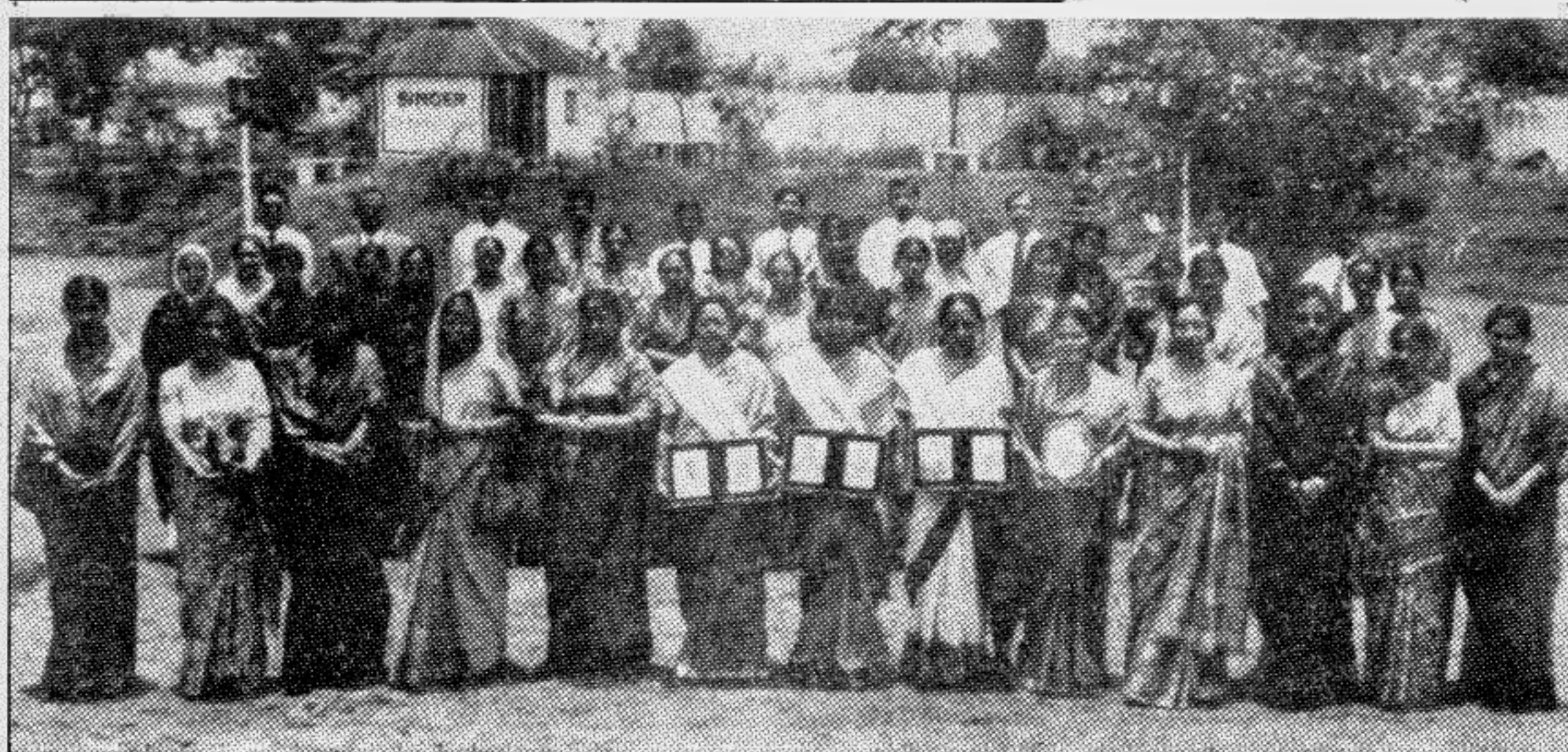
Picture shows participants of Singer Sewing Instructress Meet-97 held at Langalbandh in Narayanganj recently.

Opposition legislator Kwon Ro-gap got a five-year term, although he had strenuously denied in court receiving any bribes from Hanbo. The court said evidence pointed to his guilt.