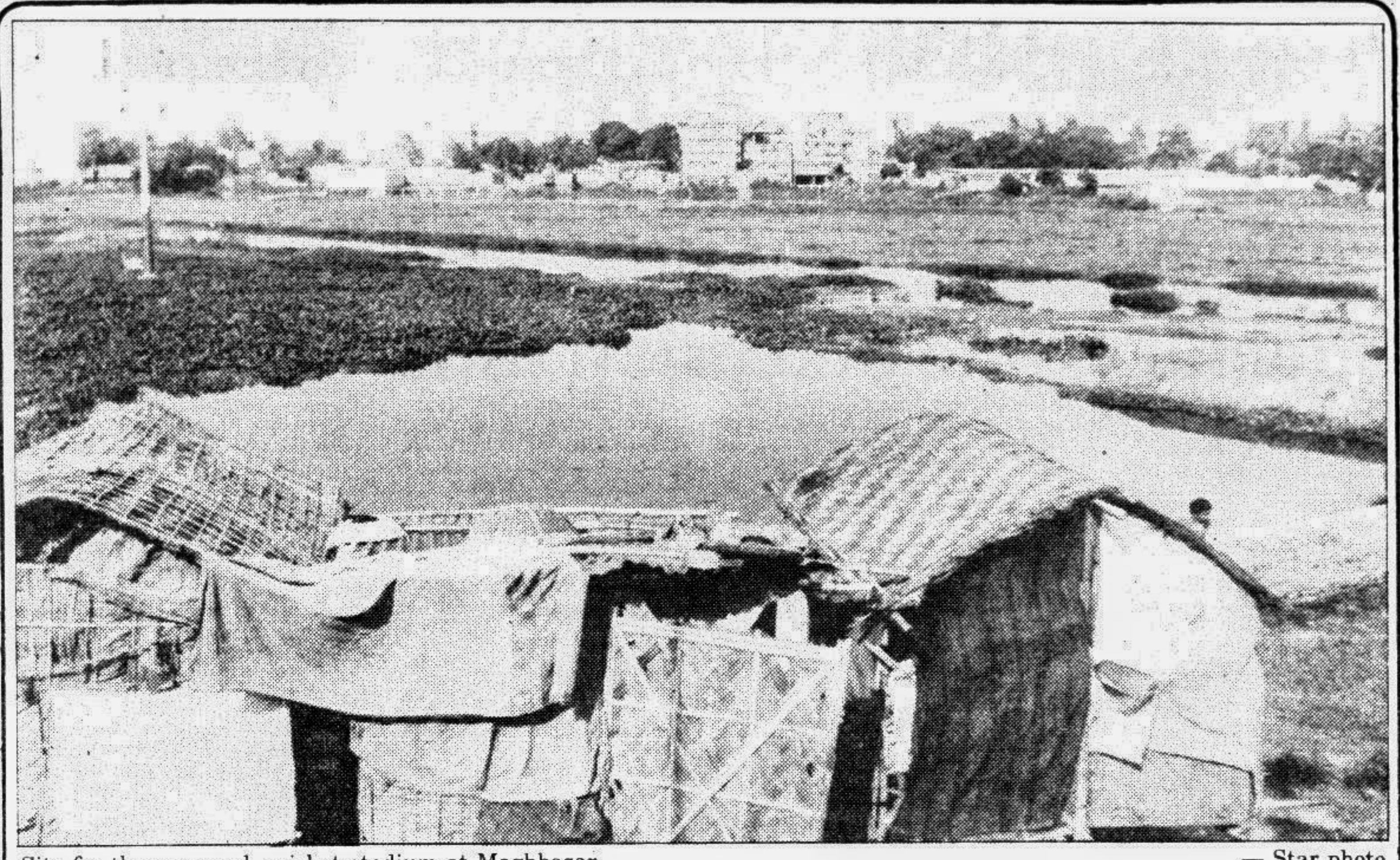
Site for the proposed cricket stadium at Maghbazar.

STAR SPORTS 6:30am World Cup League 7:00 The Asian Football Show 8:00 Inside PGA Tour 8:30 FIM World Motorcycle Championships Austrian Grand Prix