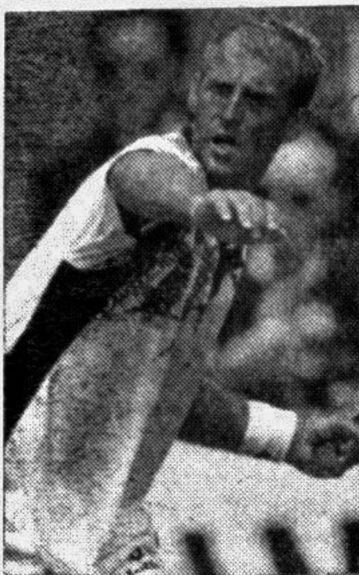
Thomas Muster (Austrian tennis star) That's the first time I've ever done this...I've never played against anyone like this. (Said of his refusal to shake hands after the French Open match against controversial opponent Jeff Tarrango).

✓ Tick the Correct Answers Competition closes 8 pm, June 13, '97