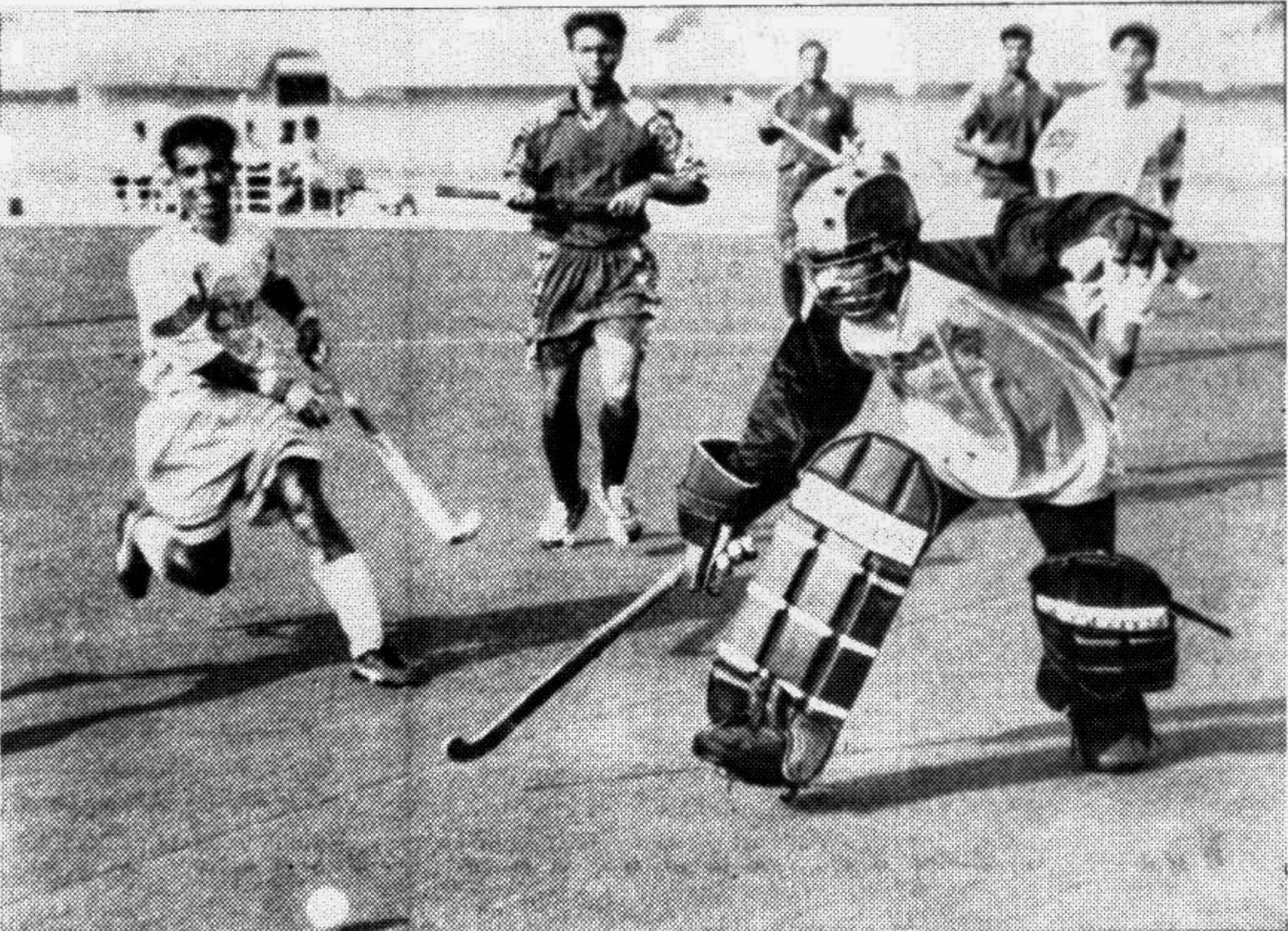
Action from yesterday's Green Delta First Division league encounter between Abahani Krira Chakra and Bangladesh Railway at the National Hockey Stadium. Abahani won 8-0.