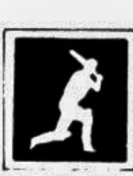
BLEWETT ... 121