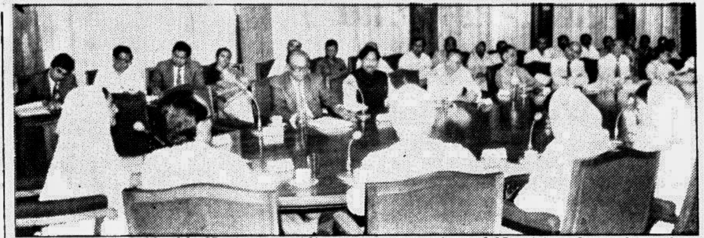
Prime Minister Sheikh Hasina presiding over a meeting of Nutrition Council at the Cabinet room in the Secretariat yesterday.

He emphasised more training for them and said the government would allow if any eligible person wants to establish a law university in private sector.