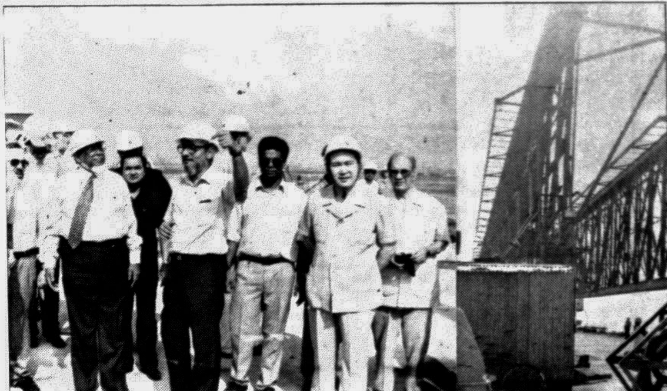
Foreign Minister Abdus Samad Azad along with heads of diplomatic missions in Dhaka visiting the under construction Jamuna Bridge yesterday to see the progress of work.