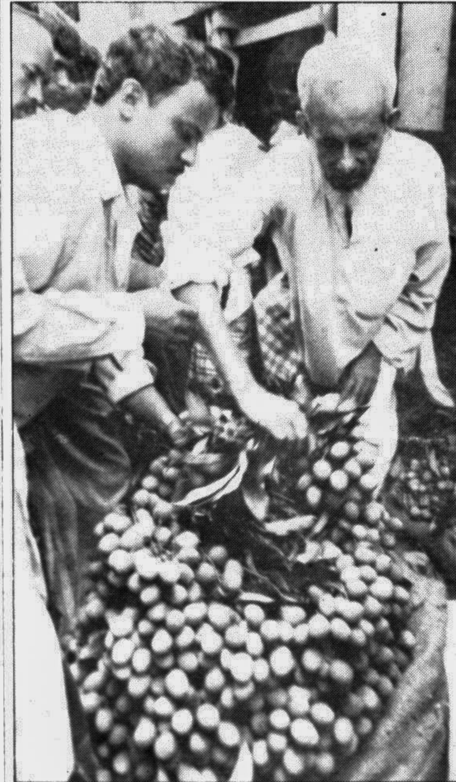
Lichis, the juicy summer special, are there in basketful at the Badamtali wholesale market in the city for Tk 250-400 per thousand.

NEW DELHI, May 31: Sonia Gandhi was at the centre stage of Indian politics today with the top brass of the country's oldest party offering to clear the decks for the reclusive widow to take charge, reports AFP. Sitaram Kesri, the present chief of the Congress (I) who faces a leadership challenge in next month's party elections, late Friday said he would quit the race if the enigmatic Sonia wanted to lead the party. Sonia is the widow of former prime minister Rajiv Gandhi, who was assassinated in 1991. Kesri said he had made her the offer previously, after her husband's death. "I had made the offer to her in 1991 and even today I am ready to withdraw if she agrees to become the party president in the interest of party unity," he said here. The Italian-born widow, after repeatedly refusing to enter Indian politics, joined the Congress this month. Since then, many party activists have asked her to take up the top job and refurbish the party's flagging image. His main rival Sharad Pawar, a member of the Congress decision-making body, who vowed to defeat Kesri on June 9 for presidency of the 112-year-old party, also said he would step aside for Sonia. Pawar, 56, had asked the party leadership to unanimously choose Sonia Gandhi, whose husband, mother-in-law Indira Gandhi and her father, Jawaharlal Nehru, led the