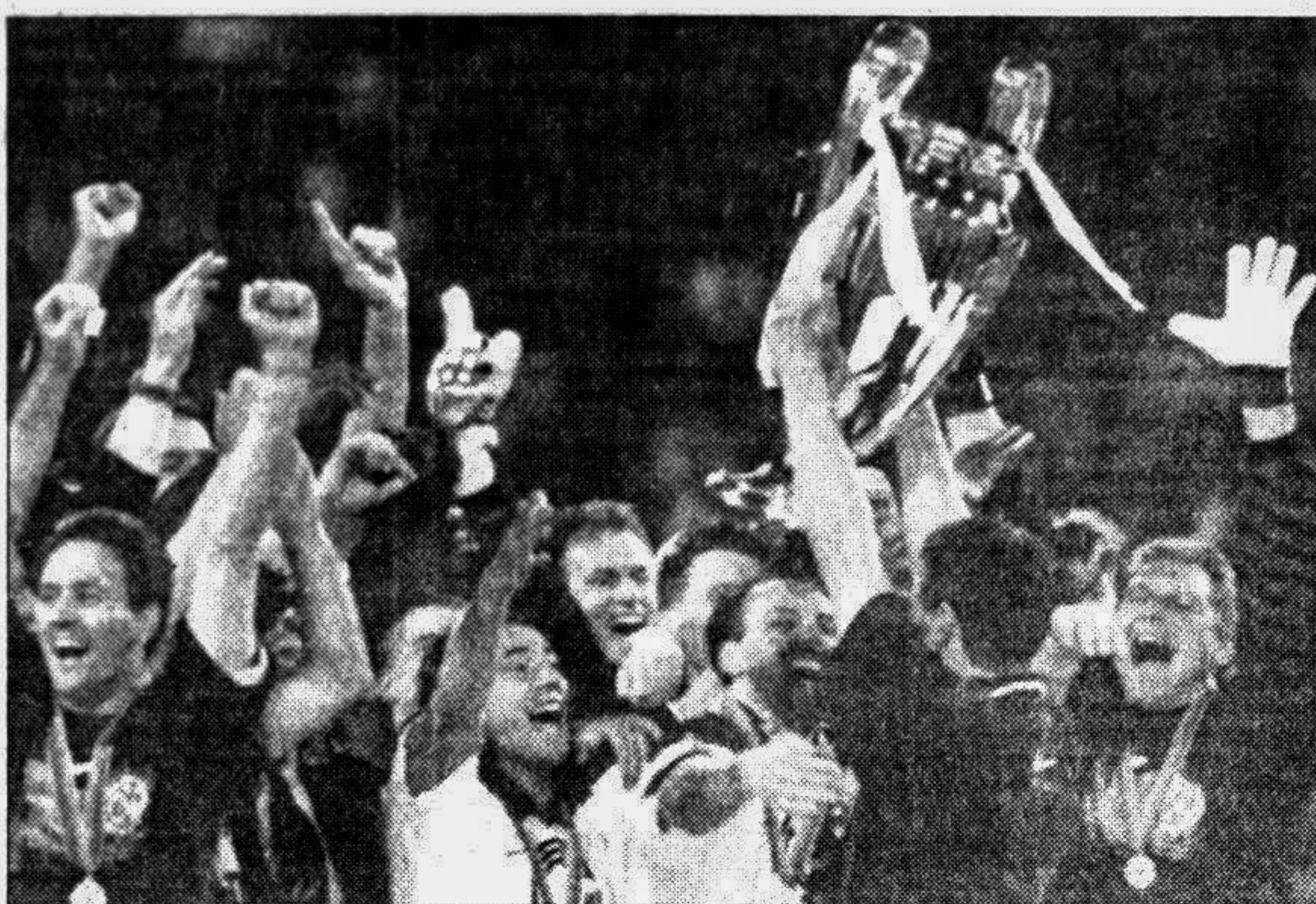
Borussia Dortmund players celebrate their European Cup triumph after beating Juventus in the final in Munich on May 28. Dortmund won 3-1.

Sports Reporter Abahani Limited have donated Taka 1,10,000 to the Prime Minister's relief and rehabilitation fund yesterday. The reputed Dhamondit outfit, one of the two giants in the domestic sports arena, handed over a check of the aforesaid amount to the Prime Minister Sheikh Hasina at her office as mark of their sympathy to the distressed millions at the coastal belts of the country.