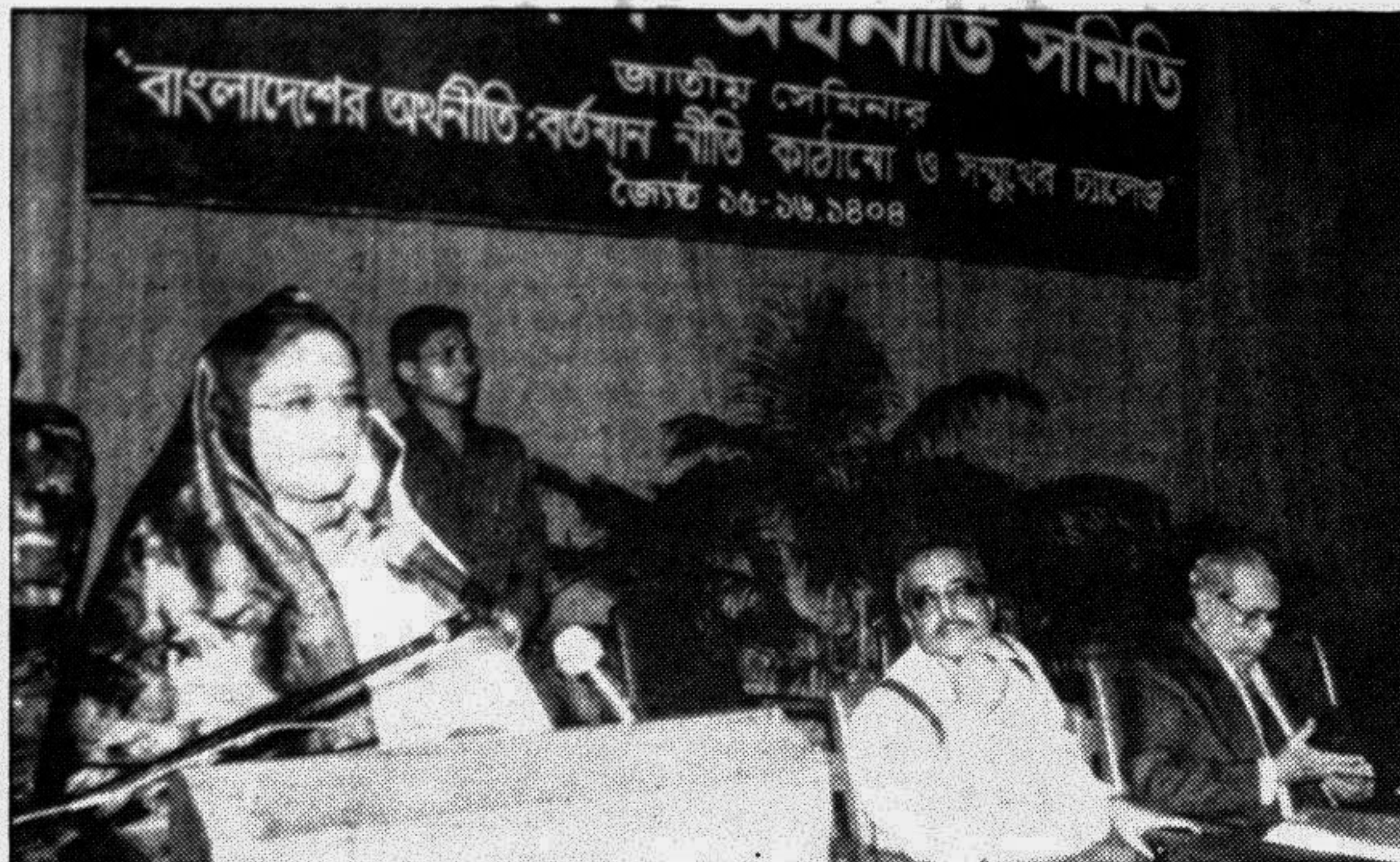
Prime Minister Sheikh Hasina addressing the inaugural session of a 2-day national seminar on 'Bangladesh economy: The current policy framework and the challenges', organised by the Bangladesh Economic Association, at the National Museum auditorium yesterday.

Only applications who are short-listed for interview will receive an acknowledgement of receipt. Applications must be received by 15 June.