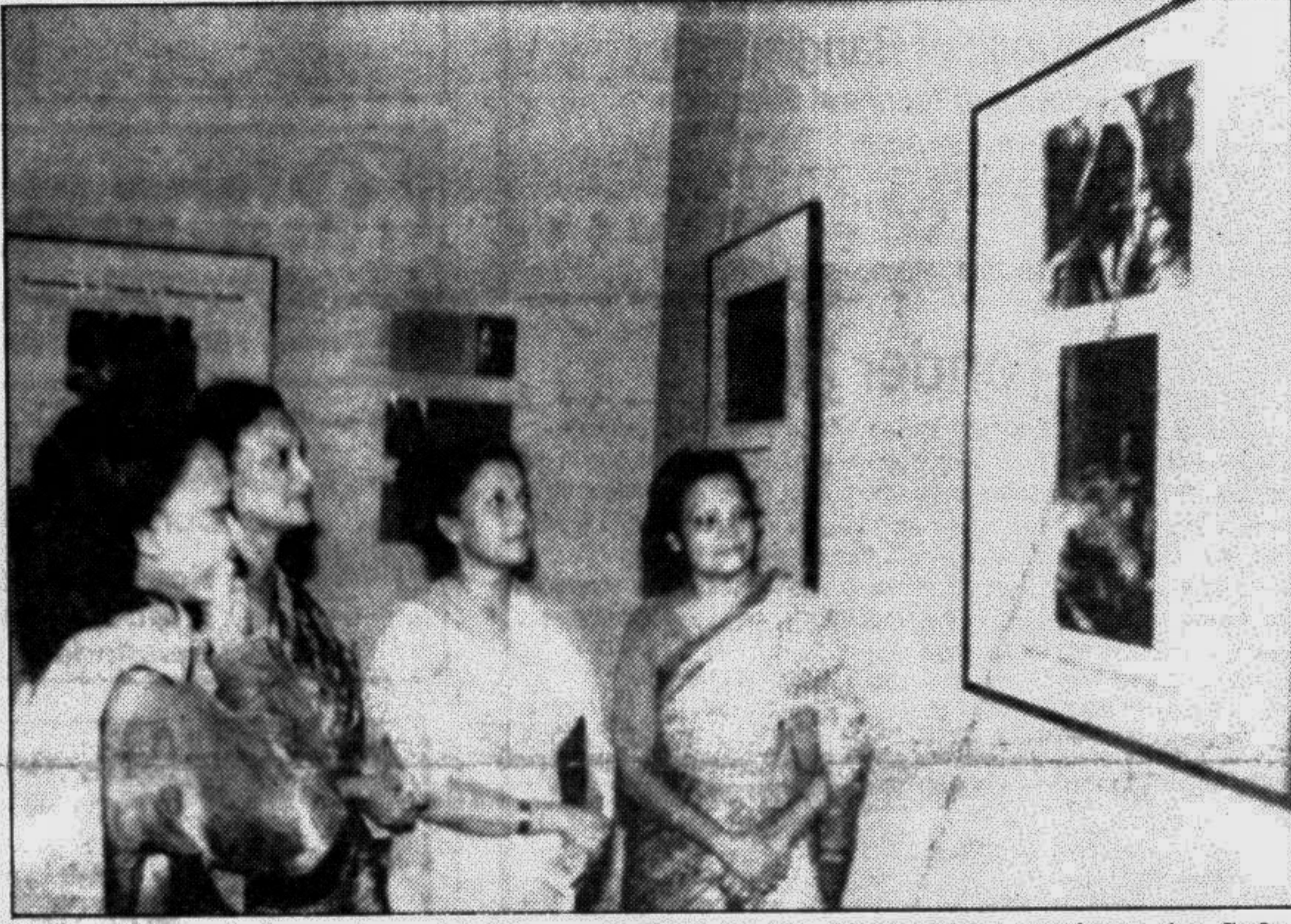
Visitors at a photograph exhibition organised by the Naripakkha marking the Safe Motherhood Day in the city yesterday.