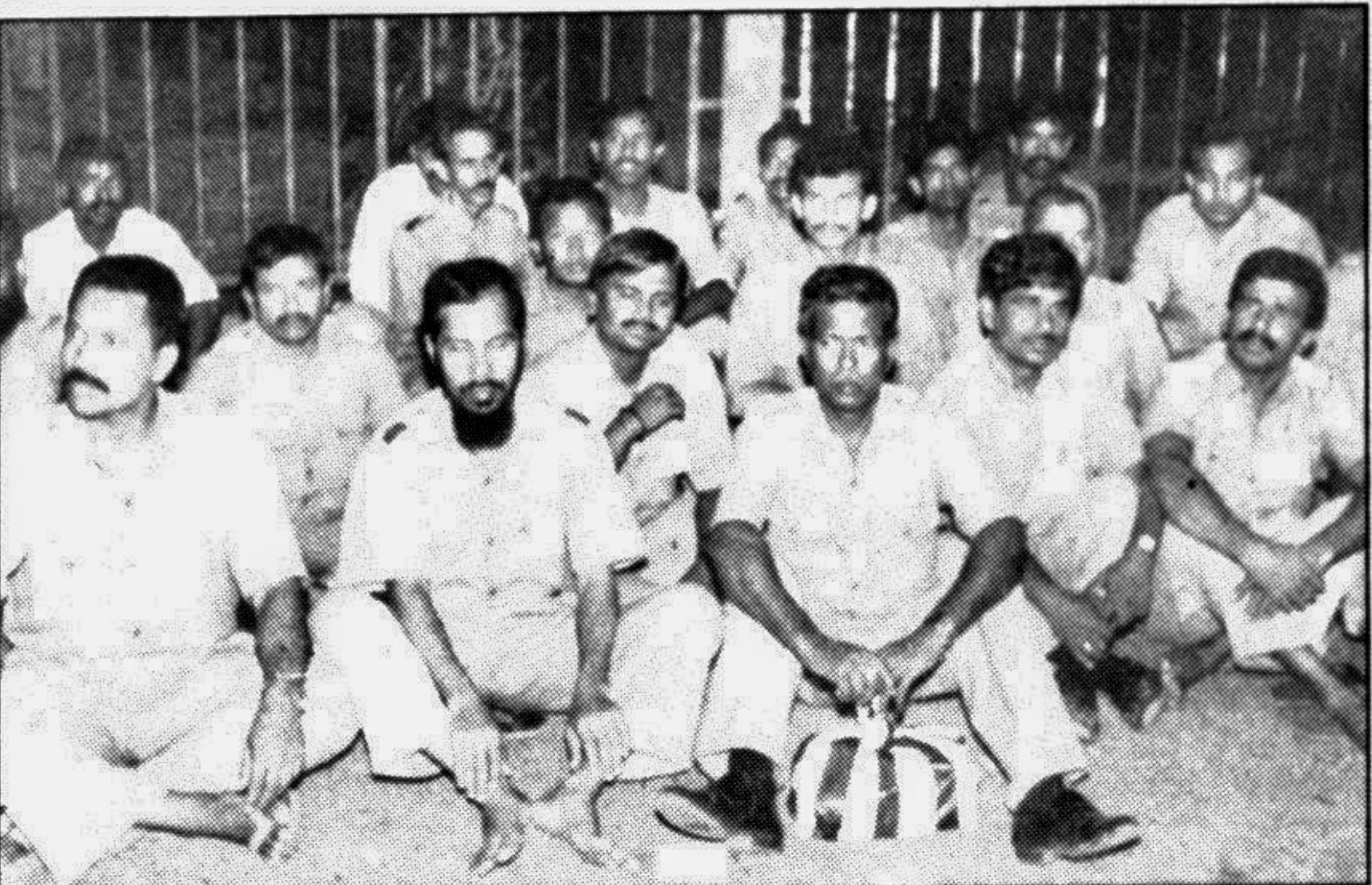
The fired security employees of the Canadian High Commission in Dhaka staging a sit-in in front of the Jatiya Press Club yesterday.

For more information call-Dhaka: 9565114, 607657, 887771, Chittagong: (031) 712127, Khulna: (041) 725008, N. Ganj: (671) 74336