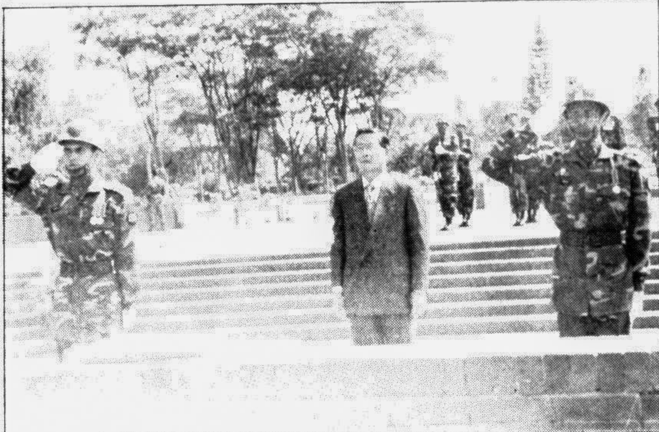
President Alberto Fujimori of Peru stands in solemn silence after placing wreaths at the National Memorial at Savar yesterday.