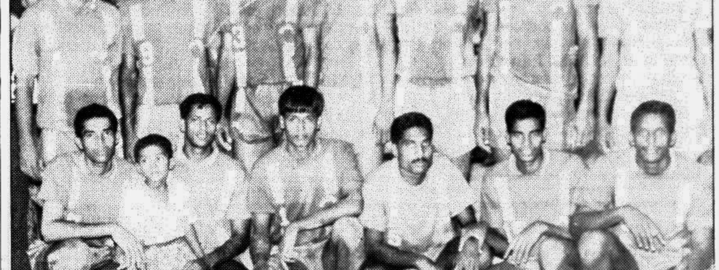
The members of the victorious BDR team, who won the National Bank Premier Division volleyball league title defeating Titas Club by 3-1 sets at the court adjacent to the Dhaka Stadium yesterday. This is for the third consecutive occasion BDR won the coveted title.