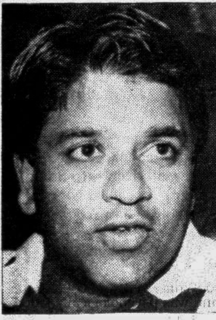
Arjuna Ranatunga (Sri Lanka cricket captain) The idea of a best-of-three finals, taken from Australia, is a good one because it gives a team a chance to overcome a bad day.