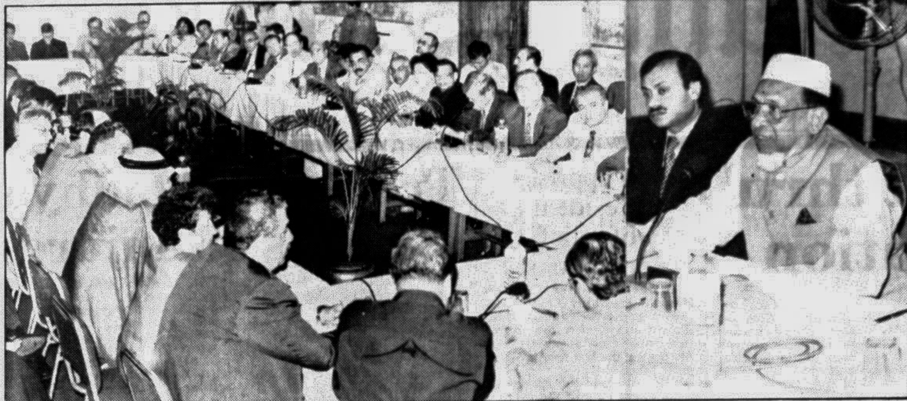
Foreign Minister Abdus Samad Azad (R) briefing heads of foreign missions in Dhaka on the extent of damage in Monday's cyclone at the Foreign Ministry yesterday.

Concern, another NGO, has undertaken emergency relief programmes of Tk 21 lakh 67 thousand for 5500 cyclone affected families in Anwara and Banskhal thana of Chittagong district. This includes, 82500 kg rice, 11000 kg pulses (dal) and 15000 meter polythene, says a press release.