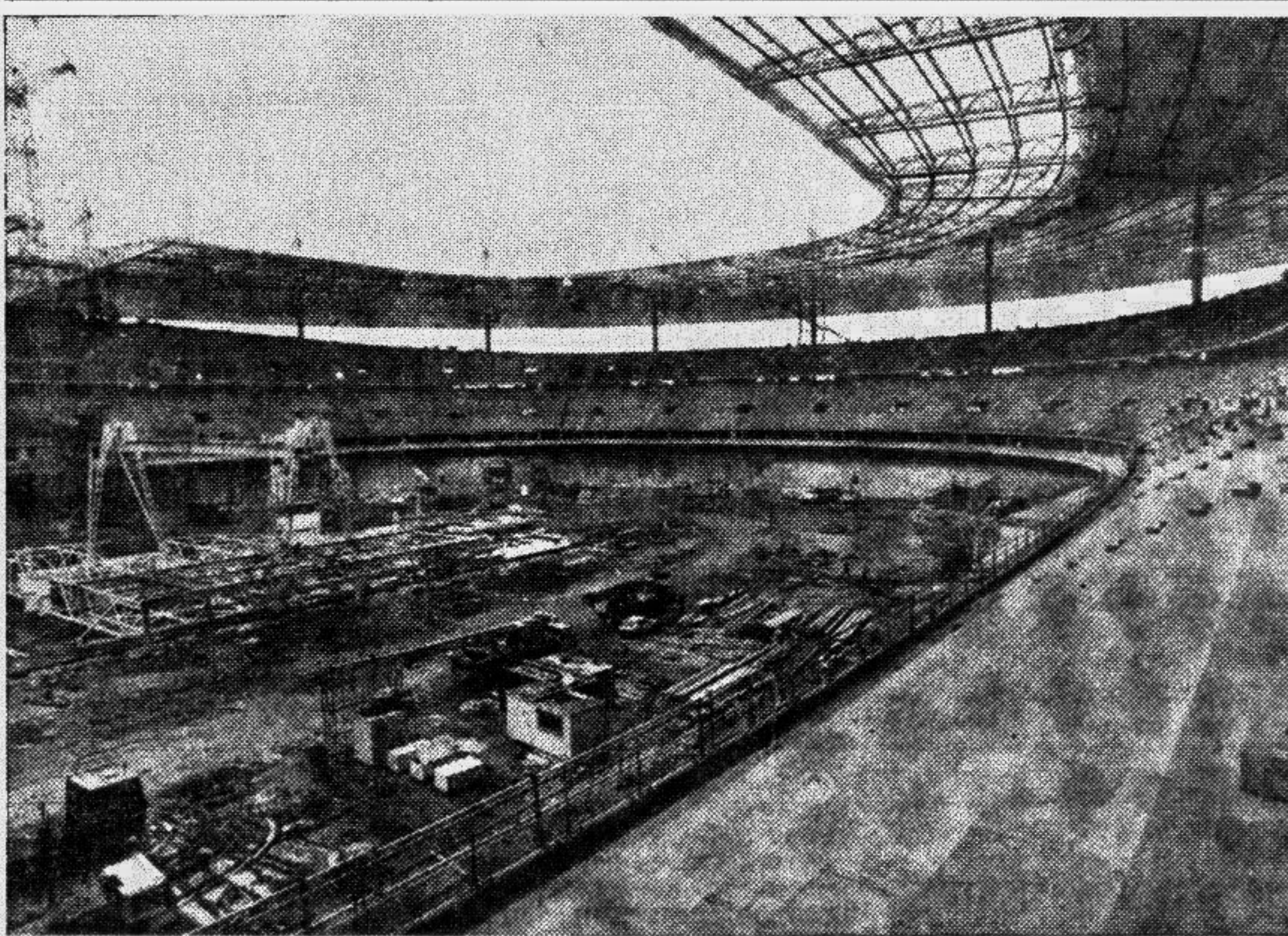
AFP filmed this view of an under construction stadium at Saint-Denis in northern Paris on May 20. Works are going in full swing at this 1998 World Cup venue.

Holloke, Phil Defreitas, Darren Gough, Dean Headley, Robert Croft. AUSTRALIA: Mark Taylor (captain), Mark Waugh, Steve Waugh, Michael Bevan, Greg Blewett or Ricky Ponting, Michael Slater, Ian Healy, Shane Warne, Michael Kasprowicz, Jason Gillespie, Glenn McGrath.