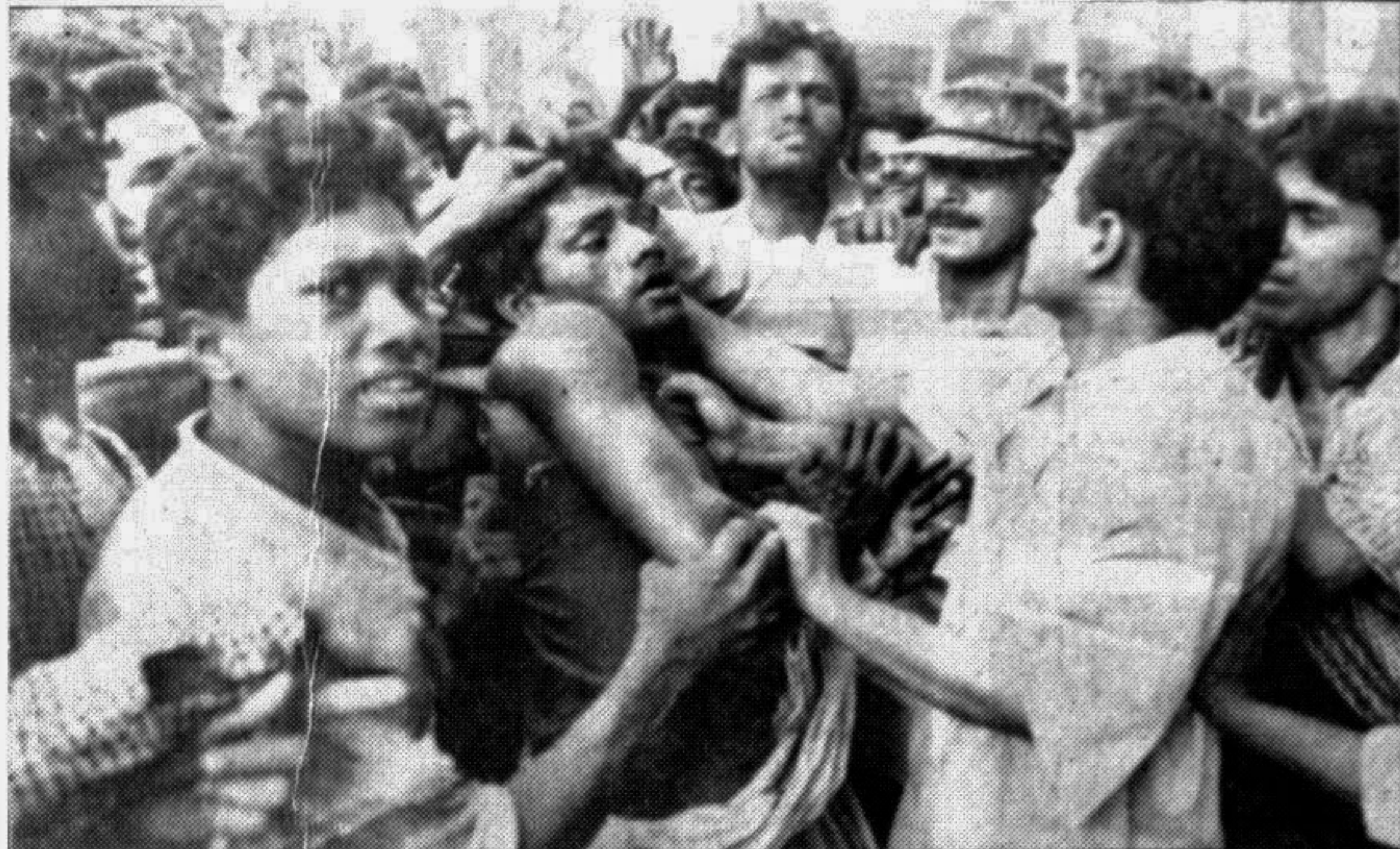
An alleged mugger facing the wrath of the public after being caught in the act at city's Stadium area yesterday.