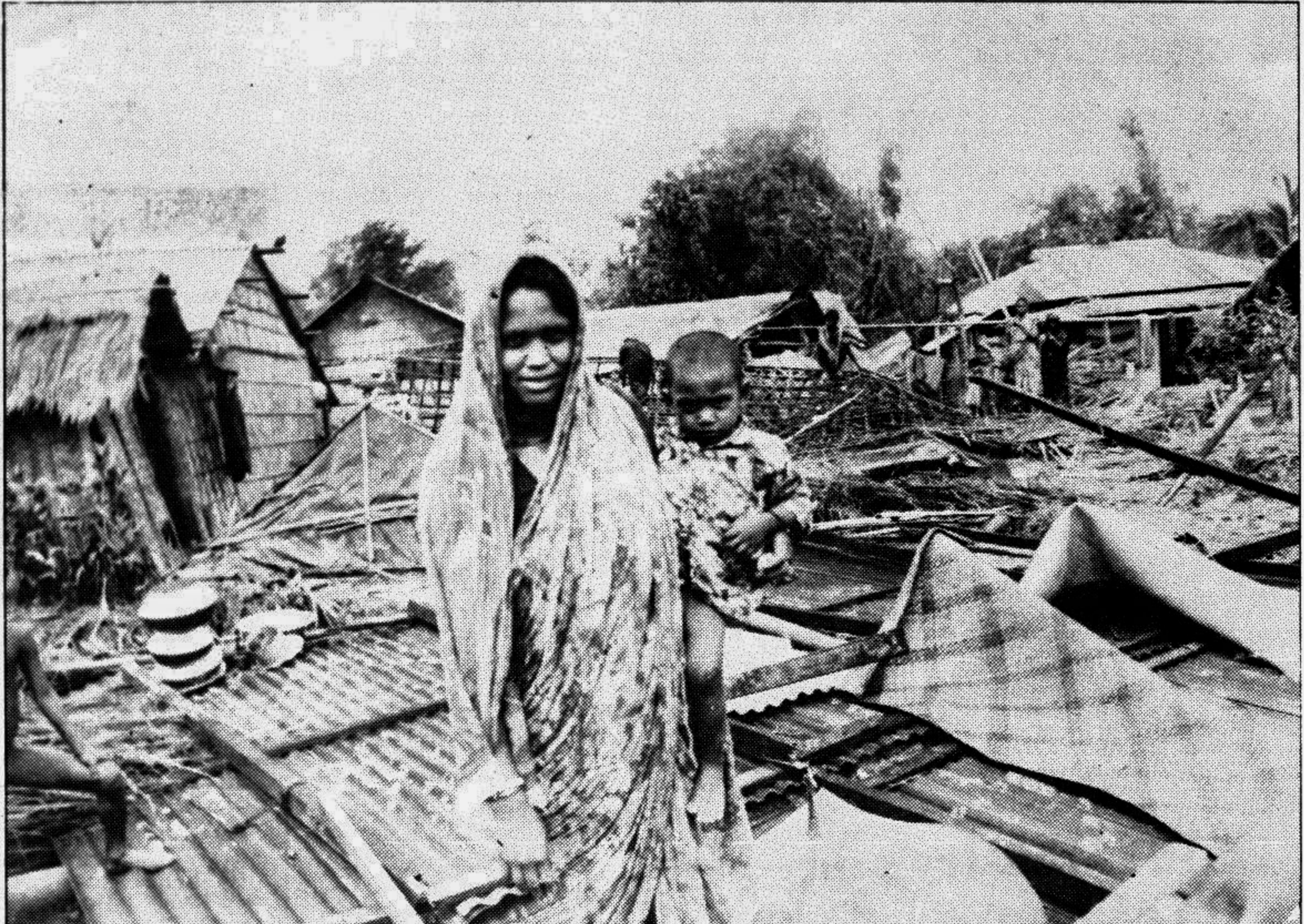
A housewife of Shikalbaha village of Chittagong stands on the debris of her house, razed to the ground by Monday's cyclone.