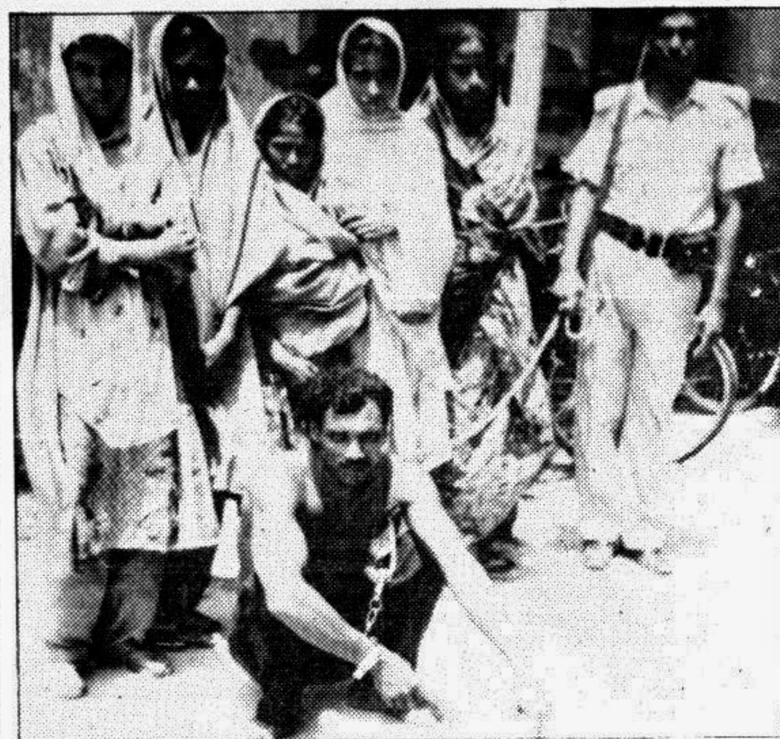
CHAPAINAWABGANJ: Five girls were rescued from an alleged woman trafficker by Nawabganj police at the local bus stand recently.

ent lonely areas of the highway and stop vehicles demanding tolls. Often they behave unfairly with the businessmen, drivers and helpers. Sometimes they torture the drivers and owners physically when they deny to pay tolls. Over one hundred small and big bus stoppages along this highway route are already occupied by the 'Chunguwallas'. They are found active till late night. Even they do not spare night coaches. If anyone deny to pay toll, he is detained for hours together. Generally, a hot exchange of words, quarrel and sometimes clash ensue between the toll collectors and drivers or helpers. Just after sundown the toll collectors are engaged in gambling and drinking wine nearby the bus stoppages. According to informations, transport workers' union has no such authority to collect tolls from the plying vehicles. At different locations there are gang leaders locally called as 'Ushtad' who control the gang of toll collectors. Some of them possess illegal fire arms, it is alleged. Sometimes, the owners of transport vehicles are compelled to enhance fare charge owing to undue tolls along the route. As such price of commodities ultimately increase in different places. The alleged toll collectors and their supporters attack vehicles and cause damage in case of disagreement. The law enforcing agencies do not take initiatives to stop such an illegal practice and the menace of Chunguwalla.