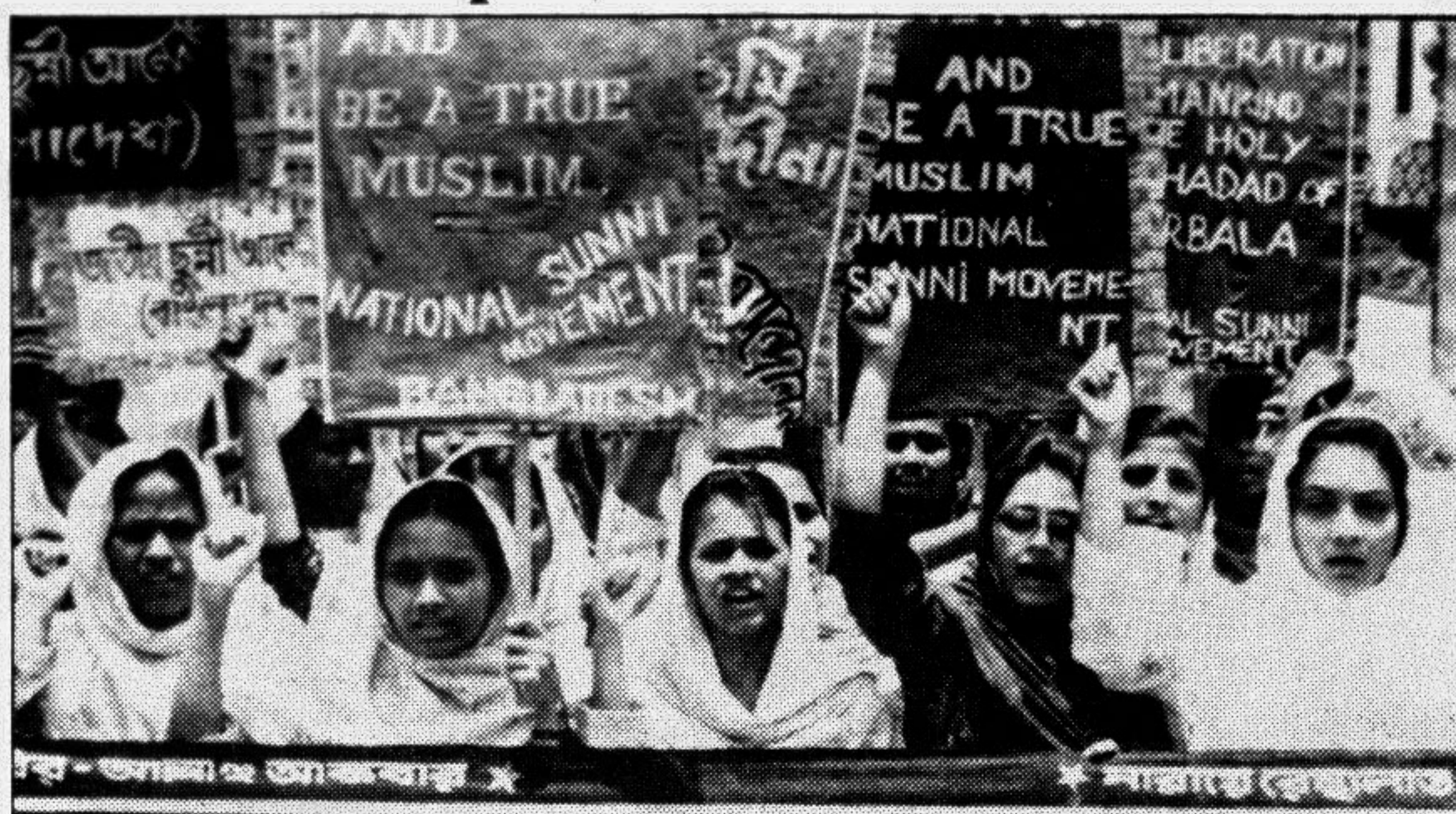
National Sunni Movement brought out a rally on the eve of Ashura in the city yesterday.

Daman • Pondicherry • New Delhi • Lucknow • Karnal • Mumbai • Pune • Indore • Bangalore