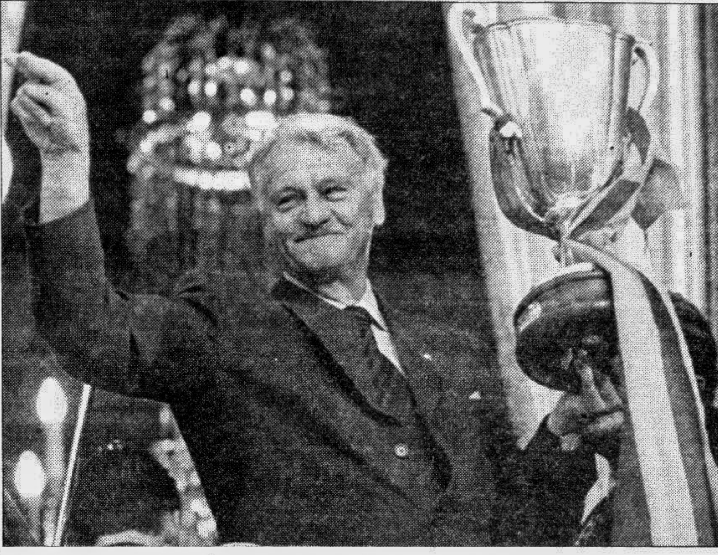
Barcelona coach Bobby Robson holds the European Cup Winners' Cup trophy as he appears on the balcony of the Generalitat Palace in Barcelona on May 15.