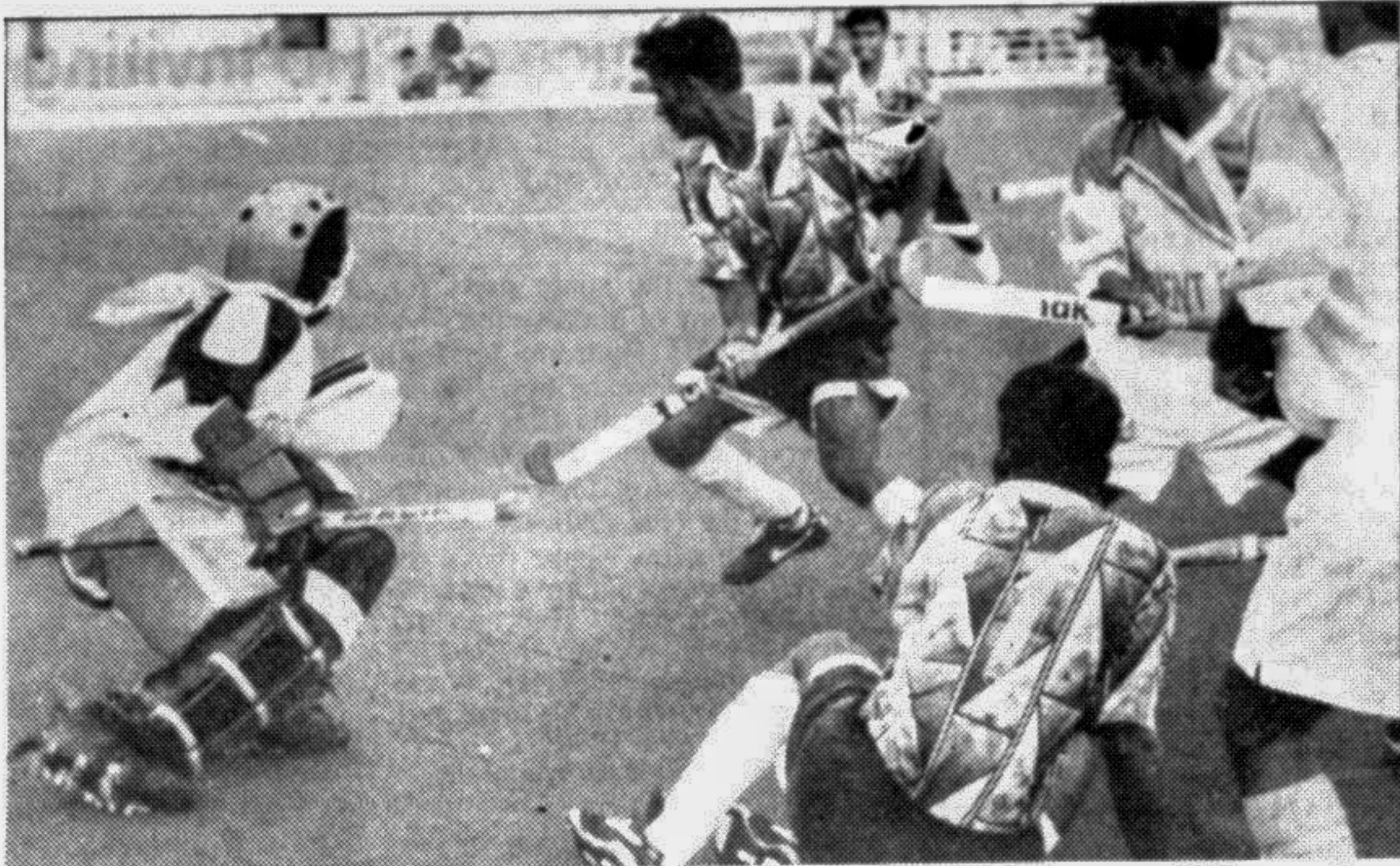
Action from yesterday's Green Delta First Division league match between Mohammedan Sporting Club and Farashganj Sporting Club at the National Hockey Stadium. Mohammedans won 2-0.

Md Mahmudur Rahman Residential Model School, Dhaka. (Remember to bring your ID card and a passport size photograph while collecting the winner's prize from the Sports Desk of The Daily Star at 7:30 pm on May 21).