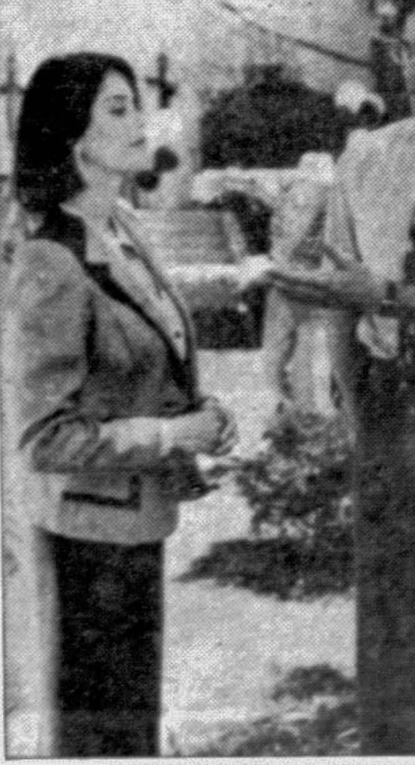
Superman on BTV, Today at 6:00 pm.

ZEE CINEMA 7:30 Do Number Ka Dima 9:30 Gunahon Ka Avtar (Jeetendra, Rajshree) 12:15 Taraana 12:30 Pyarkiya Hai Pyar Karengi (Anil Kapoor, Padmini K.) 3:15 Hit Hi Hit Hai 3:45 Taraana 4:00 Yaadon Ki Baraat (Dharmendra, Zeenat Aman) 6:45 Zandu Fimi Baatein 7:15 NoorJahan (Pradip Kumar, Meena Kumari) 10:00 Cine Music 10:30 Parivar (B/W) (Jairaj, Durga Khote) 1:15 Filer 1:45 Paap Ki Duniya (Chunky Pandey, Sunny Deol) 4:30 Filer 4:45 Raja Aur Rana