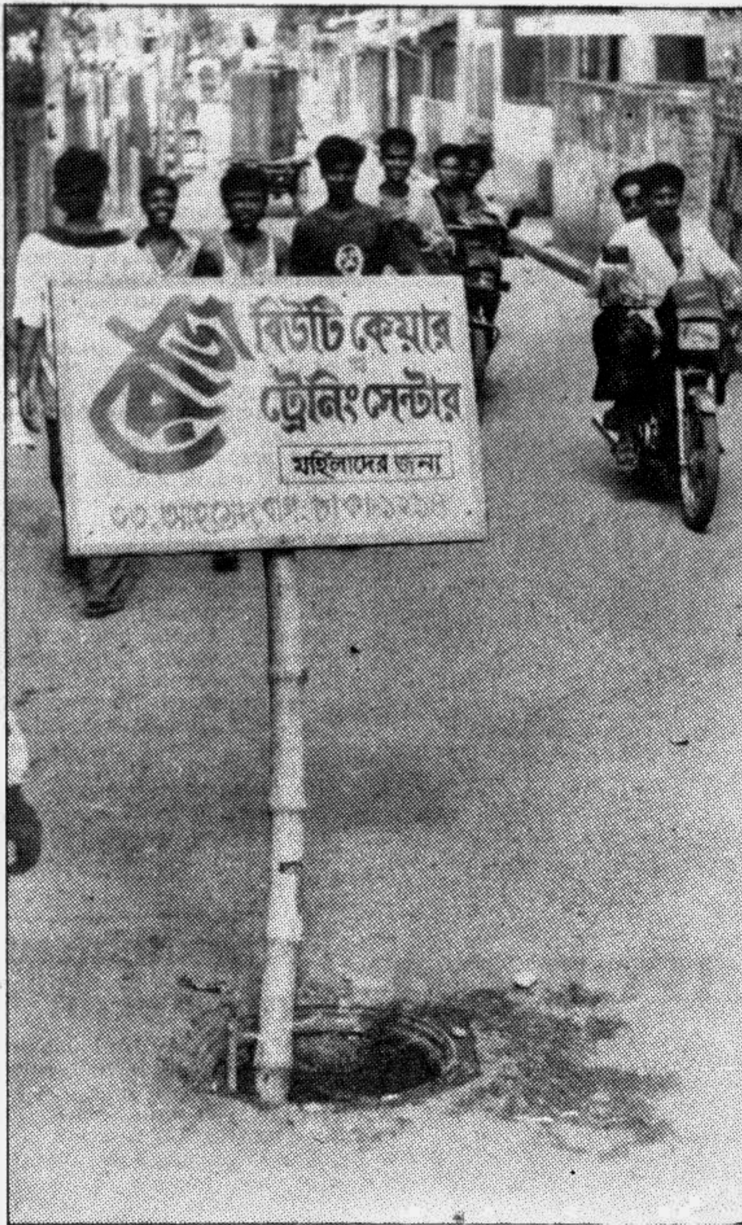
Two-in-one: A sign board on a pole placed in an uncovered manhole serving twin purposes - helping the beauticians at city's Shabujbagh with free publicity and saving the city fathers the trouble of putting up a warning sign against the danger of an open manhole, whose top has been missing since long.

Bangladesh Journalists Foundation came into being in 1992. It bought about 30 bighas of land under Digon Mujib in Mirpur for a housing project for about 150 members of the foundation.