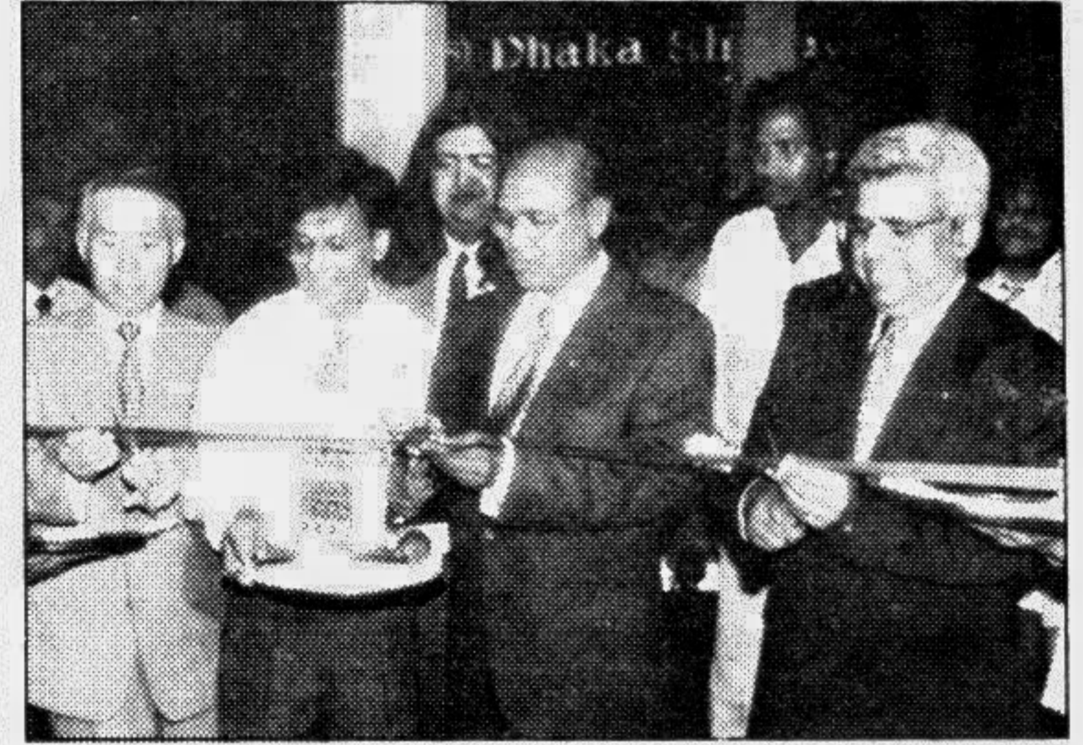
Tofael Ahmed, Minister of Commerce and Industry, cutting the ribbon at the launching ceremony of 'Prado', a new Toyota land cruiser, at a city hotel yesterday.

Organised by the Youth Development Directorate, the function was also addressed by the director general of the Directorate Fazlul Haq.