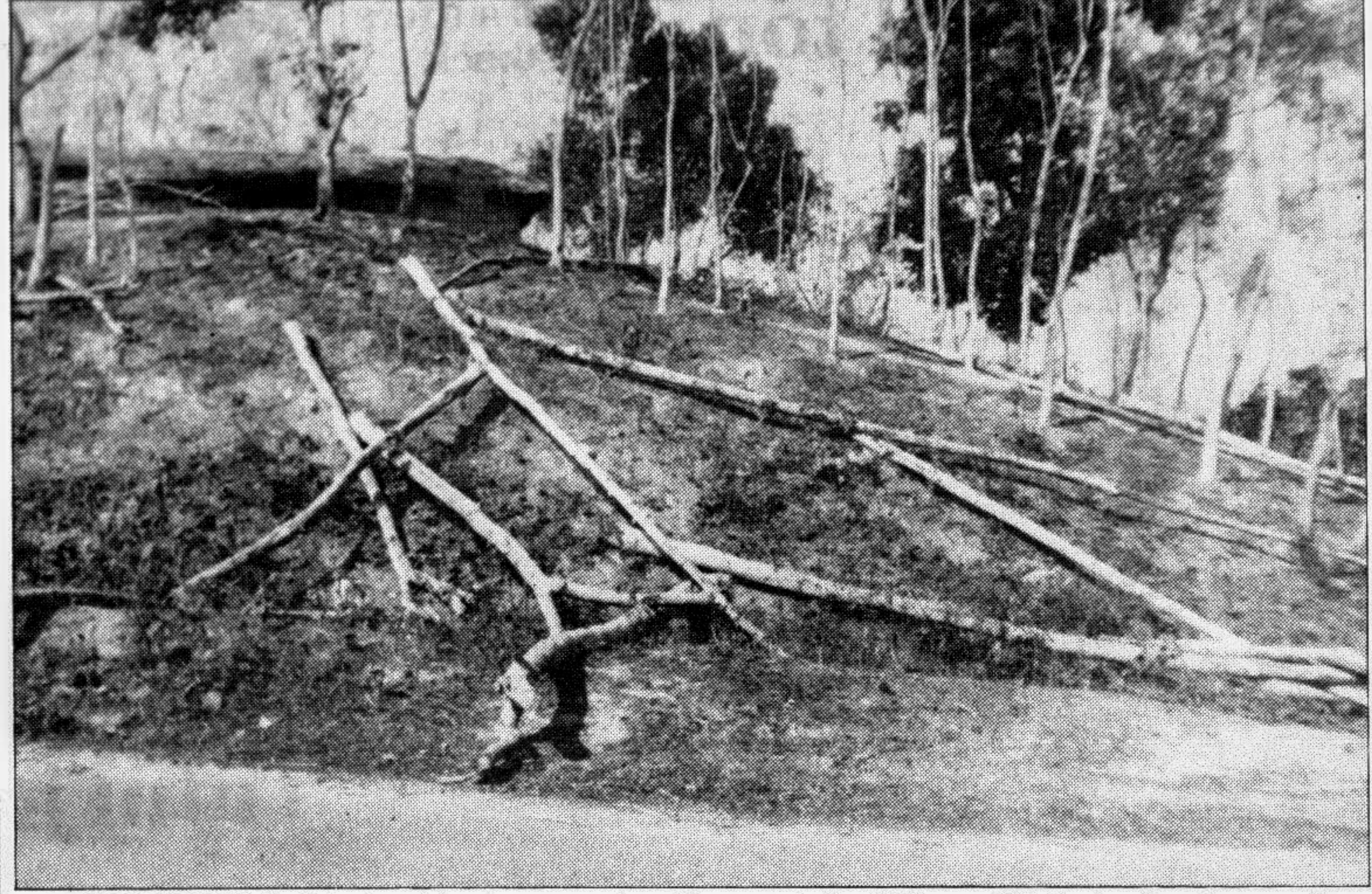
DESTRUCTION: Exploitation of forest resources is nothing new in the Chittagong Hill Tracts where huge number of valuable trees exist. As population rises demand for timber also increases at the same time. Human habitation largely affected growth of such valuable trees in the deep forest where immature trees, which fetch good amount of money, are illegally cut by local timber traders who ultimately sell them to middlemen. It is said that there is hardly any 'undisturbed forest area' which has consequently affected animal habitation. The picture, taken in March this year, shows a suburb of Rangamati town.