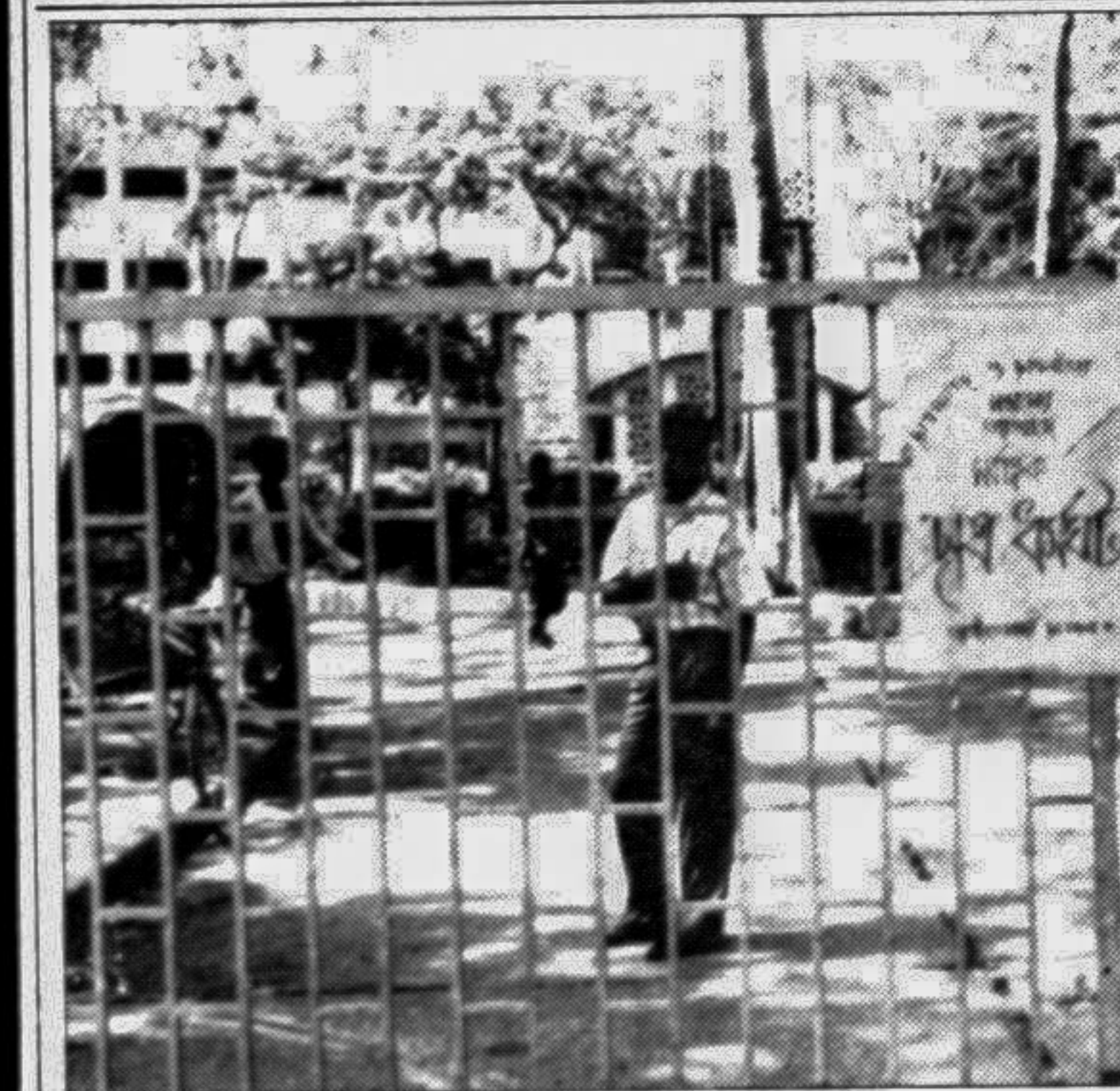
The Dhaka University campus during the strike yesterday, called by JCD.