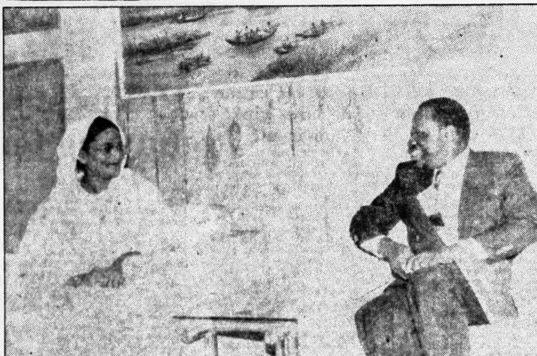
Visiting Director General of the Food and Agriculture Organisation (FAO) called on Prime Minister Sheikh Hasina at her office in parliament yesterday.