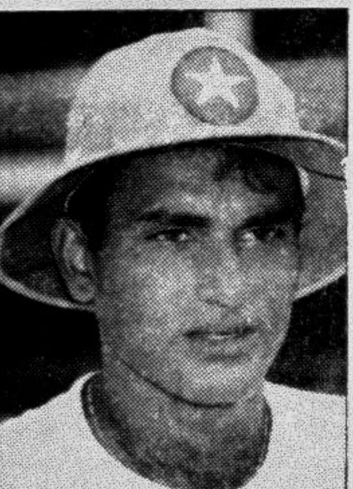
Aamir Sohail (Pakistan cricketer) "I am not an indisciplined person."