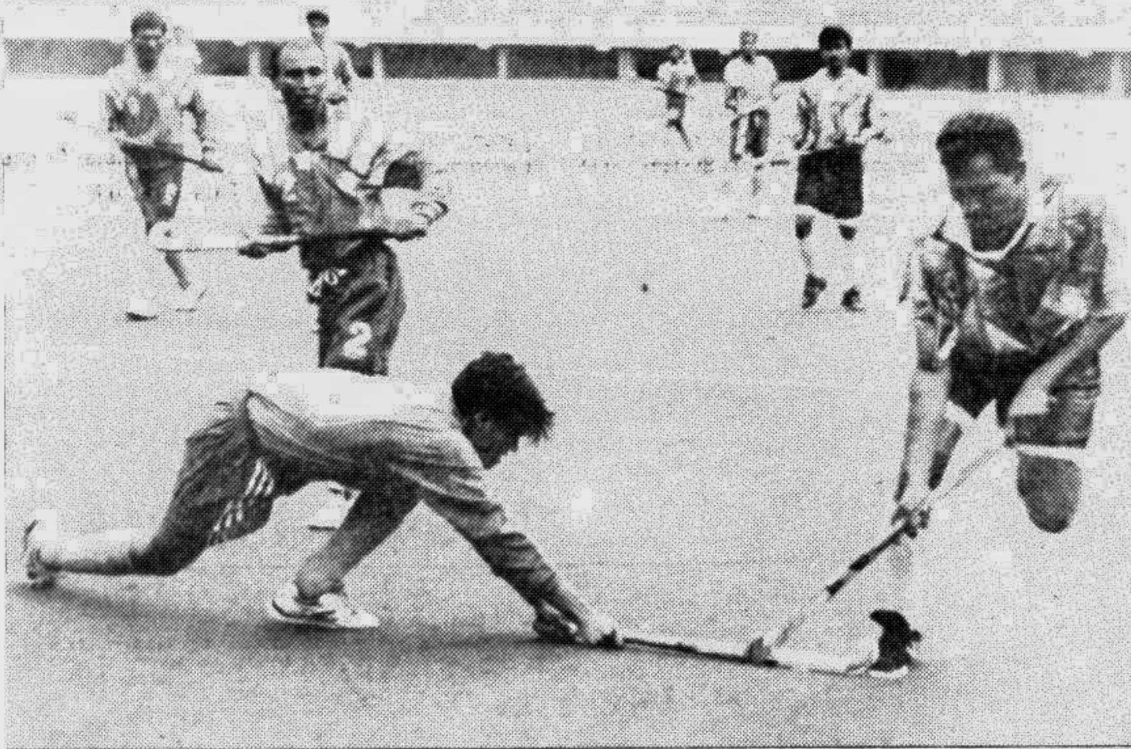
Action from the Green Delta First Division match between Mohammedan Sporting Club and Dhaka Ansars at the National Hockey Stadium yesterday. Mohammedans won 3-0.