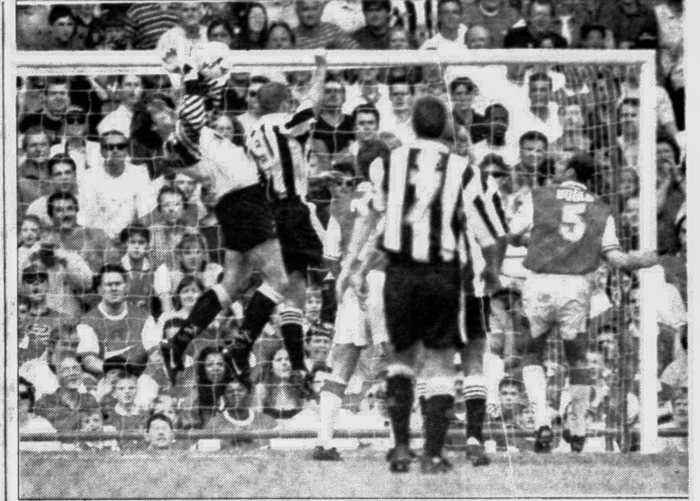
Arsenal keeper David Seaman (L) fends off a challenge by Newcastle's Allan Shearer during their FA Premiership match at Highbury on May 3.

Hingis, the world's youngest-ever number-one and who beat Seles in the Key Biscayne and Hilton Head finals last month, needed surgery after damaging ligaments in a fall from a horse two weeks ago.