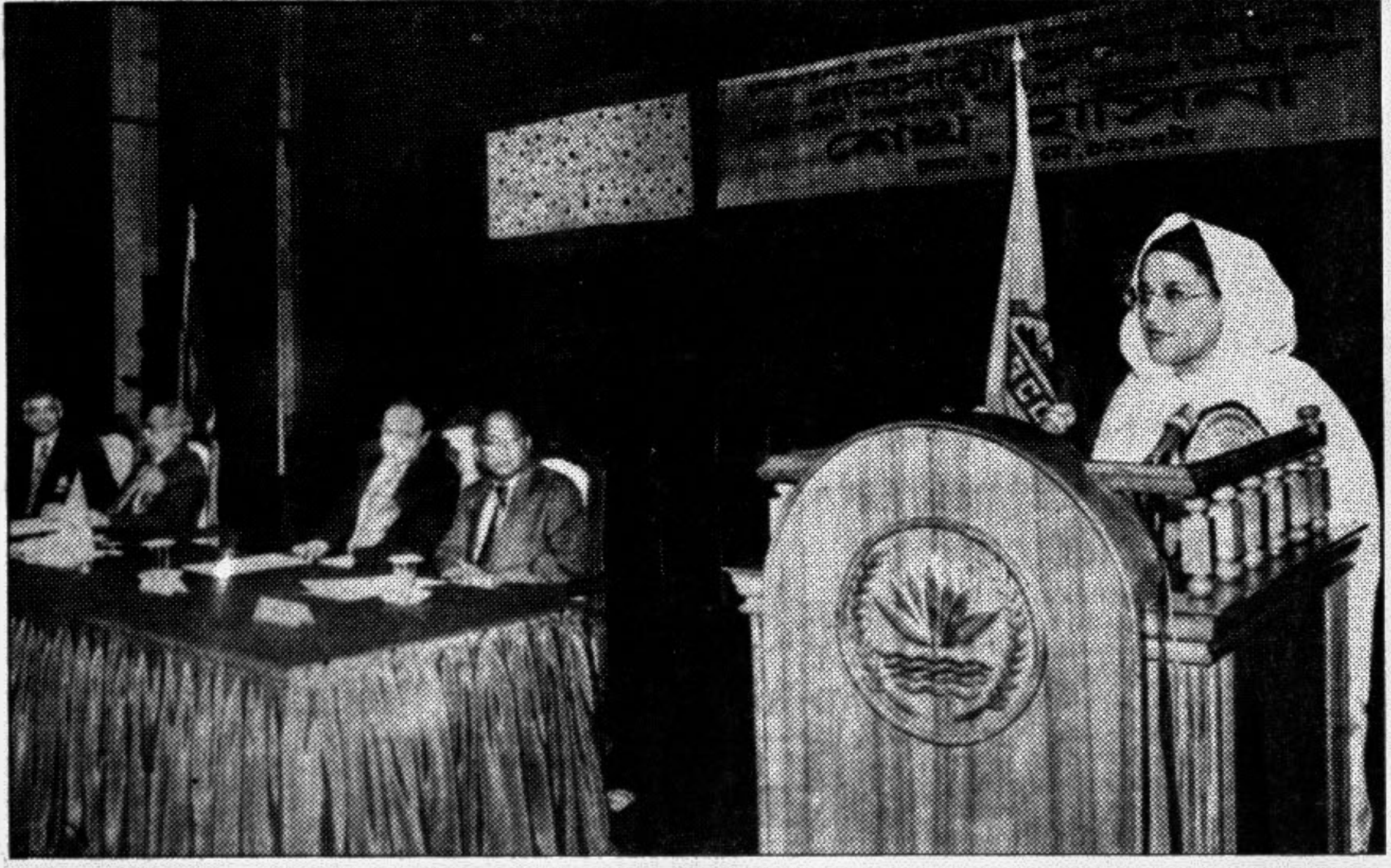
Prime Minister Sheikh Hasina addressing a Businessmen's Conference organised by the FBCCI at the Osmani Memorial Hall in the city yesterday.