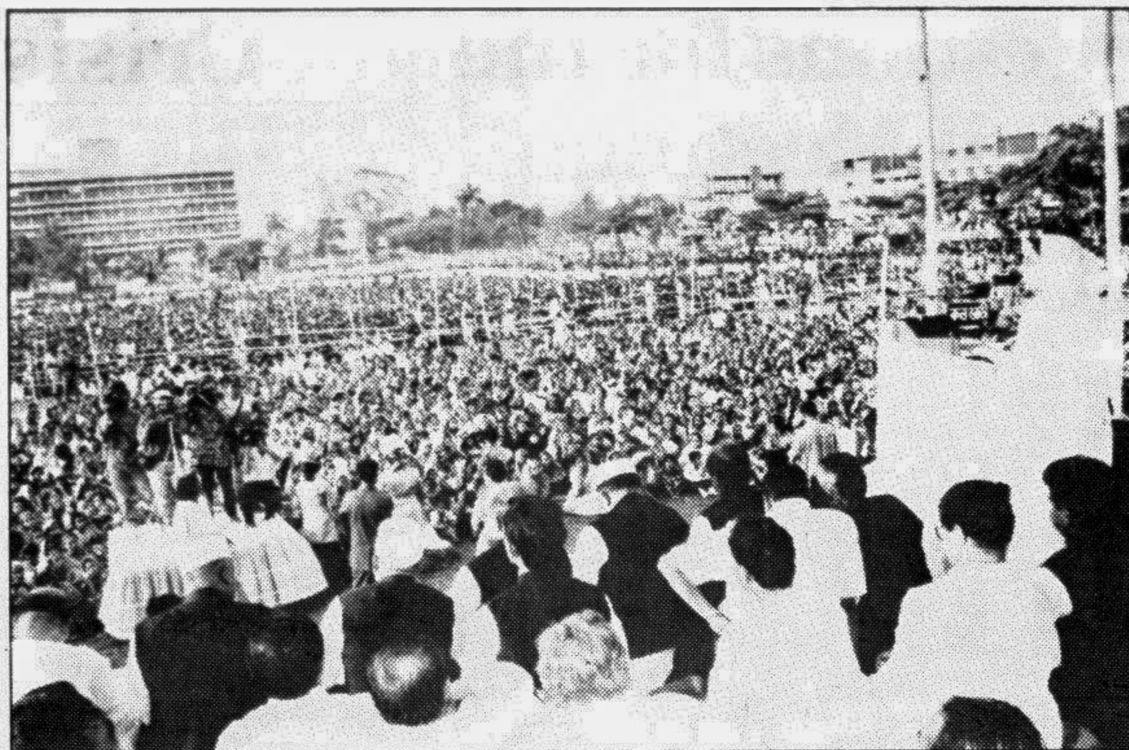
Prime Minister Sheikh Hasina addressing a rally organised by Jatiya Sramik League on the occasion of May Day at Tongi on Thursday.