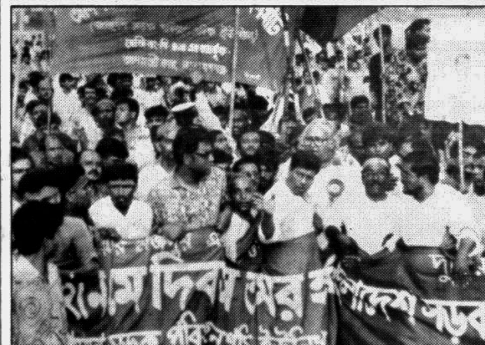
Road transport workers brought out a procession in the city commemorating May Day on Thursday.